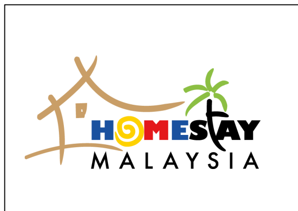
Figure 2: Official Logo of Malaysian Homestay Programme at the Host Family House