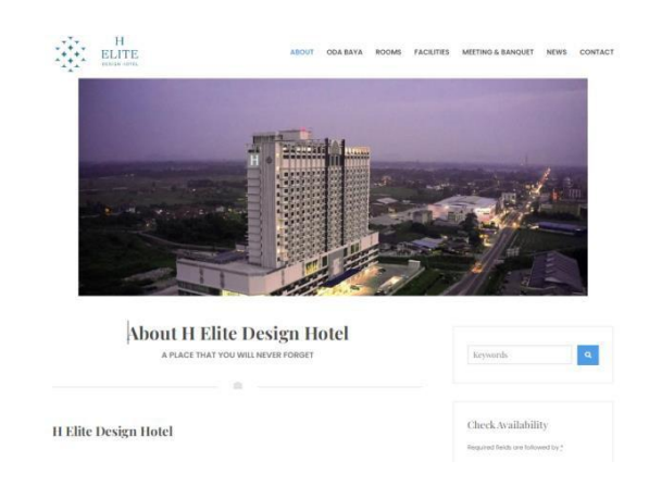
Figure 5 H Elite Design Hotel Website

https://www.instagram.com/helitedesignhotel/