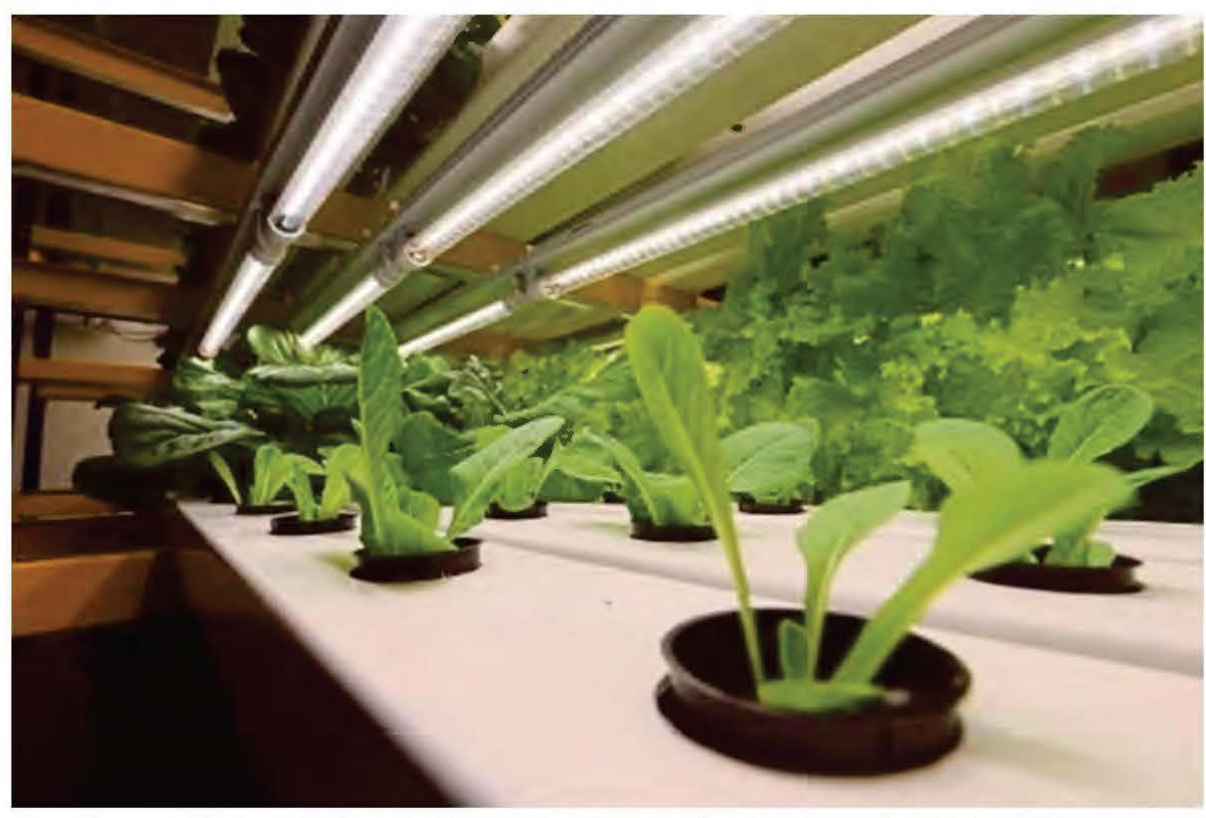
Figure 1: Hydroponic is one of the most efficient techniques to grow crops to obtain optimum results at a relatively low cost

The measurement of nutrient uptake in hydroponic plants needs constant specific attention; if there are more plant roots, nutrient uptake will decrease in plants.