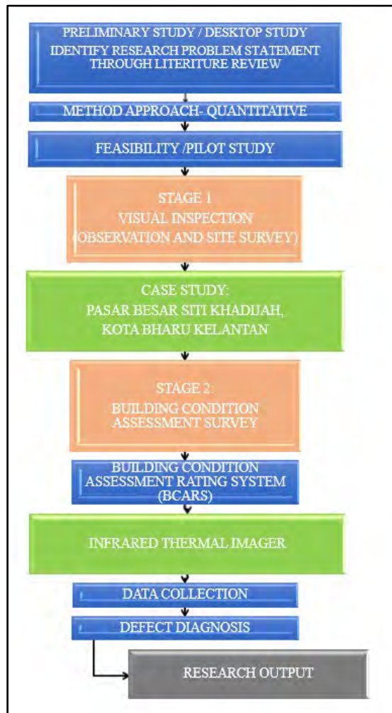
Figure 1: Research Design Work Process.