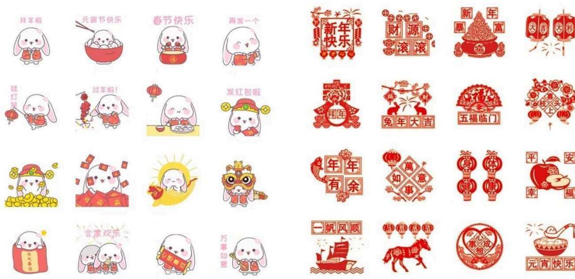
Figure 5. Rabbit Year Spring Festival Stickers in Different Styles

or a modern and humorous version. Emojis and stickers representing traditional Chinese cultural features are included into daily communication in a flexible and unrestricted manner to accommodate users' needs (Yang, 2021).