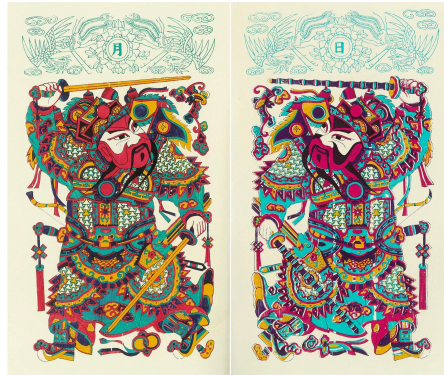
Figure 1. Door gods, Qin Qiong and Jing De, Ming Dynasty.

To sum up, in the long social and cultural progress and historical changes, the theme and elements of YangJiaBu new year woodcut prints have also changed continuously. YangJiaBu new year woodcut prints, as a folklore cultural product, contain a profound and systematic process of cultural development and characteristics of artistic evolution, both from the historical point of view and from the modern point of view; whether in the composition, theme, colour and image of the expression is very elaborate, and truly express the It truly expresses of people's customs and habits, thoughts and feelings, lifestyle, aesthetic point of view and other aspects of the needs. Therefore, the review of YangJiaBu folk culture, combined with the analysis and discussion of scientific theories, will be conducive to the contemporary cultural development and practical innovation of YangJiaBu new year woodcut prints, which will have theoretical significance for the increase of creative sources of culture and the expansion of folk culture research, and will have important inspirational significance for the innovative development of the society.