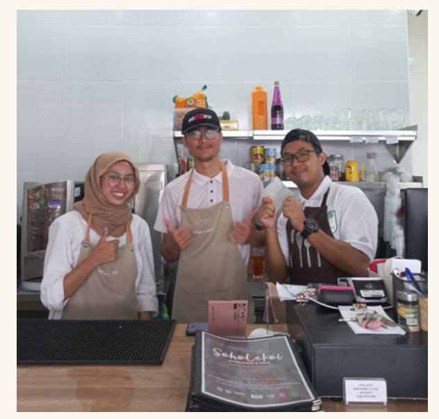
Me with service and kitchen crew at the counter