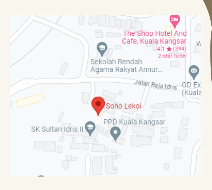
Soho Lekoi location on google map