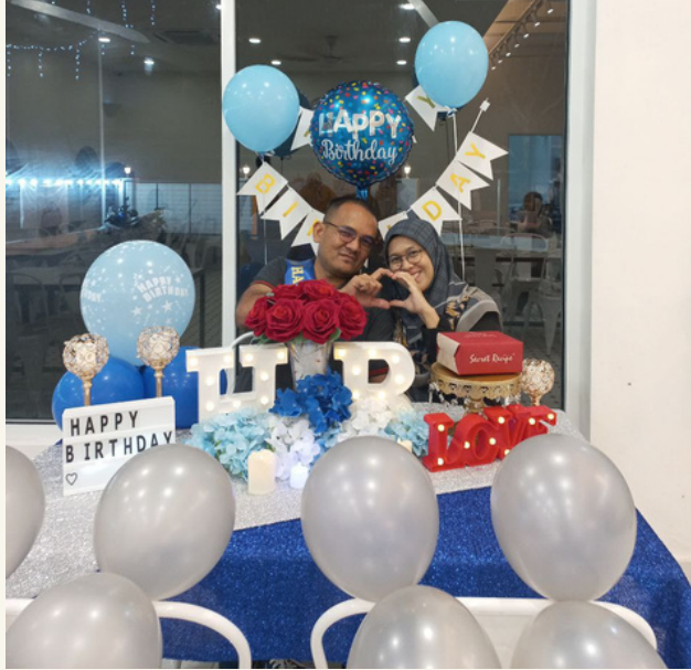
A happy couple celebrating the wife's birthday