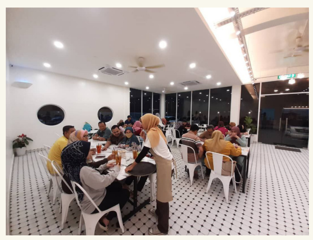
An image of me serving food to customer

I recommend the cafe supervisor to let the staff know when a customer provides a positive feedback about their service. Commend the staff if they have performed well. Besides, by setting key performance indicator (KPI) for them to work, the owner can offer a commission or bonus if they are able to increase the sales. The managers also can make the staff efforts feel appreciated by offering allowances, health incentives or even something as simple as giving them a day off on their birthday.