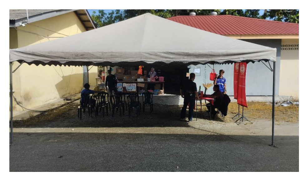
Distribution of Pesticide Subsidy under SIPP