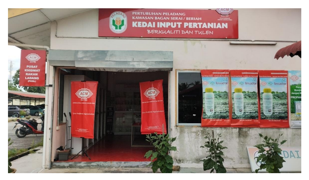
Agricultural Input Shop / Pusat Khidmat Rakan Ladang (PKRL)