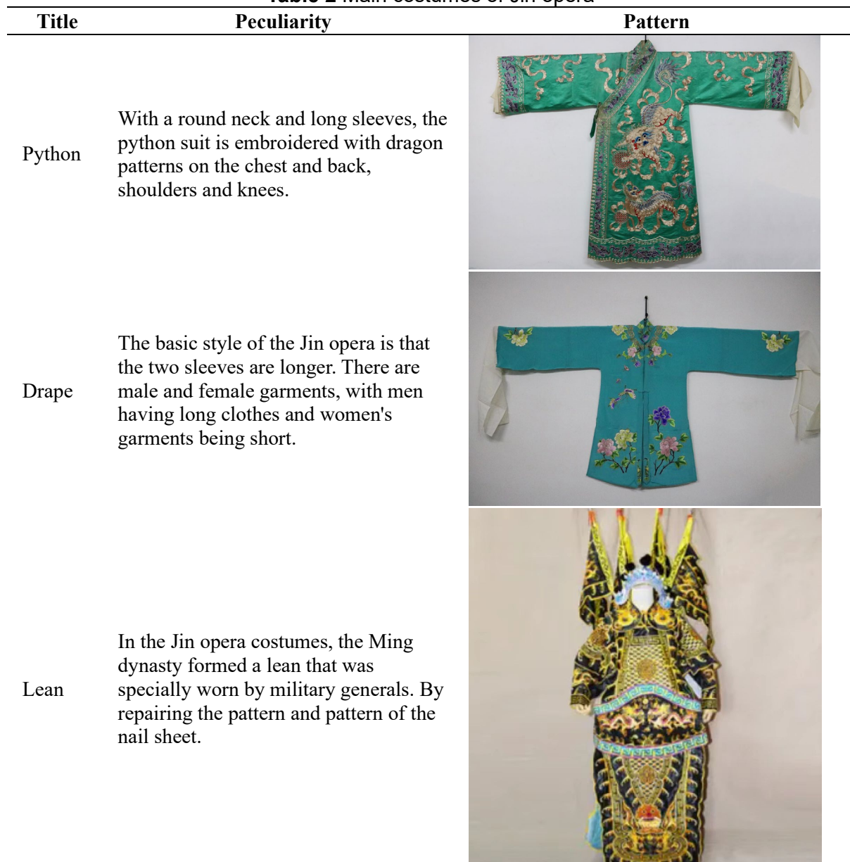
Table 2 Main costumes of Jin opera

Jin opera costumes are called xingtou, which refers to the general term worn by actors in Jin opera repertoire performances (Peng Bingyu, 2019). Jin opera costume styles include python, drape, lean, pleats, helmets, etc. (Guo Yunli, 2018). Through a fieldwork on the Jin Opera in Shanxi Province, this study systematically summarizes the main costumes of the Jin Opera, as shown in the following table: