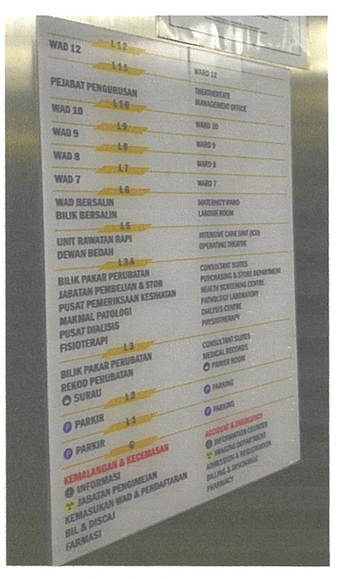
Patient and the family can easier find the department by looking this list at the lift

department. Additionally, there are board rooms for meetings of the board of directors or staff members as well as training rooms for training programmes and talk sessions by external or internal speakers. All of these departments are interconnected to ensure that the management process is running smoothly.