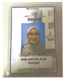
Id tag for trainee

My journey internship at Putra Specialist Hospital, Melaka within 14 weeks from 1st March 2023 to 15th August 2023 to fulfill the requirement for course subject Human Resource Internship (HRM666). I work from Monday to Friday from 8.30 am until 5.15 for weekdays and 8.30am until 12.45pm for Saturday.