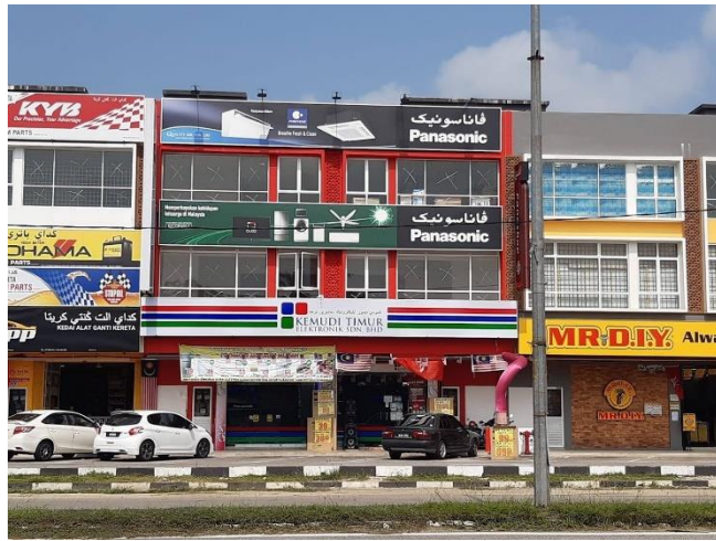
Figure 1 Kemudi Timur Elektronik Sdn Bhd Headquarters