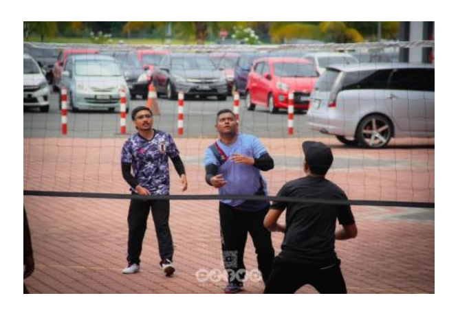
Playing Netball with RELA Perlis Members