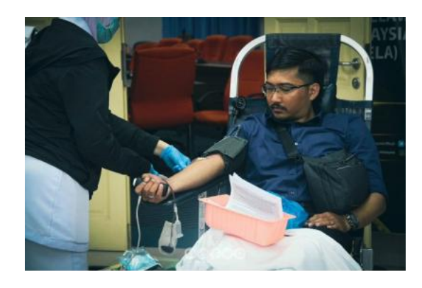
Program Blood Donation With KKM