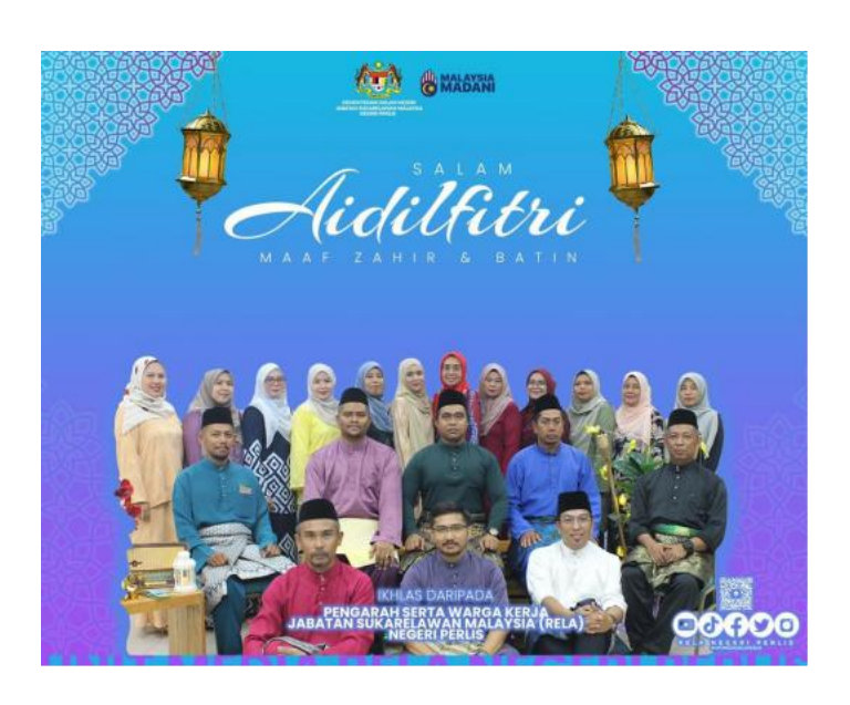
Eid al-Fitri Event with all Administration Department RELA Perlis