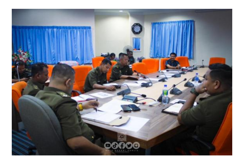
Attending Monthly Meeting with all staff