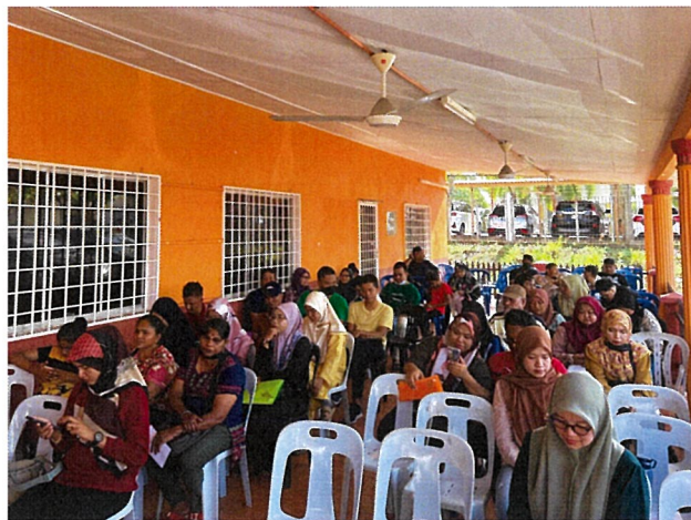
INTERVIEW SESSION FOR THE TANGGA BATU PPR HOUSE APPLICATION ON 7 AUGUST 2023 -10 AUGUST 2023 (WEDNESDAY) HELD AT DEWAN JAPERUN PANTAI KUNDOR, MELAKA