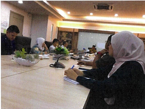
JOIN THE MEETING WITH THE DEVELOPER HANDAL GROUP