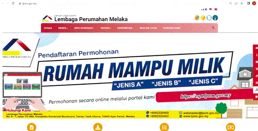
WEBSITE LEMBAGA PERUMAHAN MELAKA

Other than that, the background company for Lembaga Perumahan Melaka is in previously they were under the Melaka State Development Corporation (PKNM) and when they had developed successfully, they set up their own office building at Kompleks Komersial Boulevard Ayer Keroh, Melaka. Lembaga Perumahan Melaka is one of the Melaka state government agencies that was established on 17 December 2002 through the Enactment of the Melaka Housing Authority (ELPM).