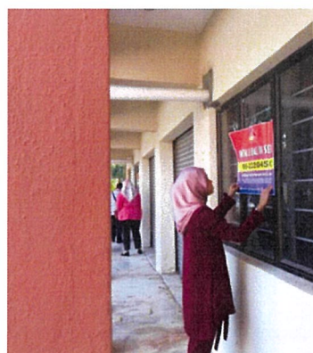
SITE VISIT TO THE SHOP PANGSAPURI SUNGAI PUTAT