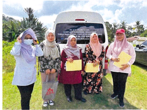
SITE VISIT AND INTERVIEW SESSION FOR THE MELAKA RUMAHKU PROGRAM APPLICATION ON 7 JULY 2023