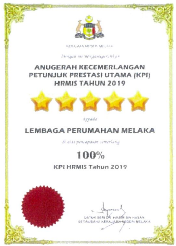
Anugerah Kecemerlangan Petunjuk Prestasi Utama HRMIS 2019 Tahun 2019