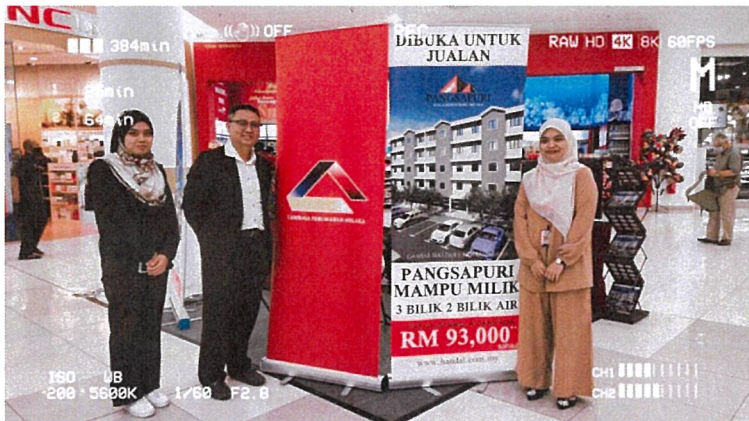
OPENING OF THE KUALA SUNGAI BARU PROSPEROUS HOME REGISTRATION COUNTER ORGANIZED BY HANDAL GROUP TOGETHER WITH LPM 29 MAY - 4 JUN 2023