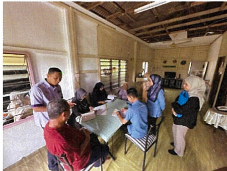
SITE VISIT AND INTERVIEW SESSION FOR THE MELAKA RUMAHKU PROGRAM APPLICATION 3 MAY 2023