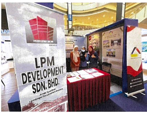
HOUSE EXPO (MAPEX) AT AEON BANDARAYA MELAKA ON 18-23 JULY 2023