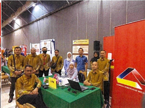
THE MELAKA STATE GOVERNMENT OPEN DAY PROGRAM ON 22 JUN 2023