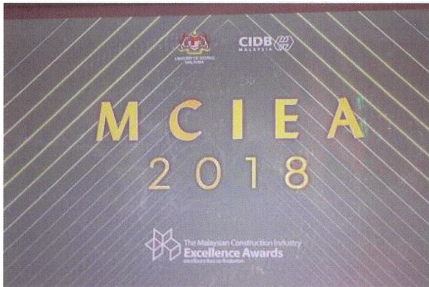
Anugerah Kecemerlangan Industri Pembinaan Malaysia (MCIEA) 2018 Kategori Anugerah IBS Sijil Pengiktirafan Khas MCIEA 2018 bagi kategori Anugerah Kontraktor Terbaik