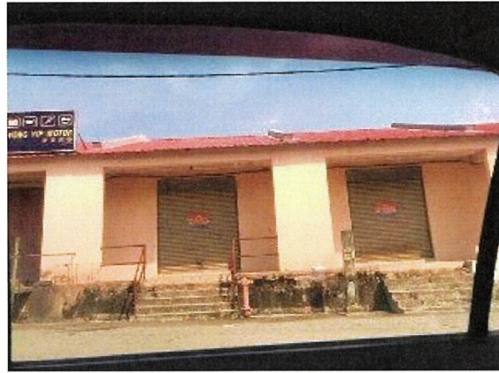
SITE VISIT TO THE SHOP IN THE KRUBONG