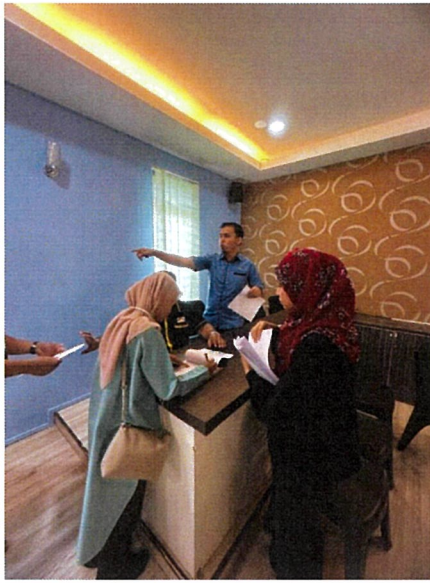
LOTTERY FOR THE KAJANG FOLD-UP HOUSE PROGRAM ON 4 APRIL 2023