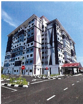
PPR TANGGA BATU

Next, project Program Perumahan Rakyat (PPR) in Krubong, Sg Putat, Tehel, Tangga Batu and Klebang is under Lembaga Perumahan Melaka. Thus, all of the maintenance and repairing services borne entirely by Lembaga Perumahan Melaka for this project.