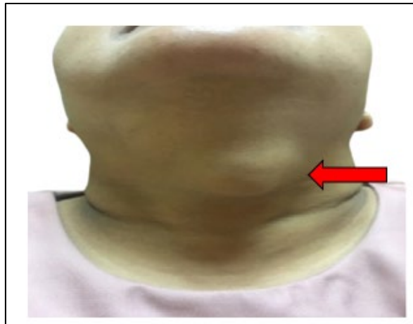
Figure 1 Midline anterior neck mass

A computed tomography (CT scan) of the neck (Figure 2) displayed huge multiseptated cystic mass measuring 4.4cm (W) x 3.3cm (W) x 4.1cm (CC) with an enhancing solid component within measuring 1.0 cm x 0.9 cm and located inferior to the hyoid bone. Laterally the mass was near to the left sternocleidomastoid muscle. Inferiorly it is minimally compressing the adjacent left upper thyroid lobe with an irregular margin with no clear demarcation seen between the mass and the adjacent strap muscles. No extension is seen into the larynx. Cervical lymph nodes are not enlarged, and submandibular and thyroid glands are normal.