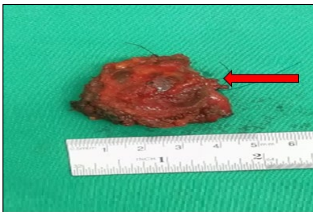
Figure 3 Thyroglossal duct cyst specimen removed by Sistrunk's operation

Histopathological examination of the specimen showed presence of psammoma bodies, with no lympho-vascular invasion to the capsule and it was reported as papillary thyroid carcinoma. Three months post operatively, ultrasound guided FNAC of the thyroid gland was performed. It showed a benign follicular nodule suggestive of colloid goitre. The patient has been on regular 6 monthly follow-ups and has not shown any evidence of recurrence.