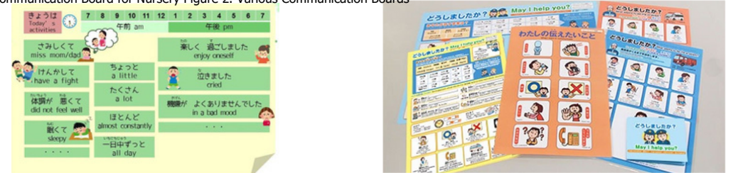
Figure 1. A Communication Board for Nursery Figure 2. Various Communication Boards

Hiroshima International Plaza Meiji Yasuda Mental Health Foundation < https://hiroshima-hip.or.jp > < https://www.my-kokoro.jp/communication-board >