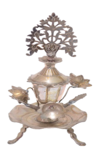
Figure 2. Celak from Malay World Ethnology Museum