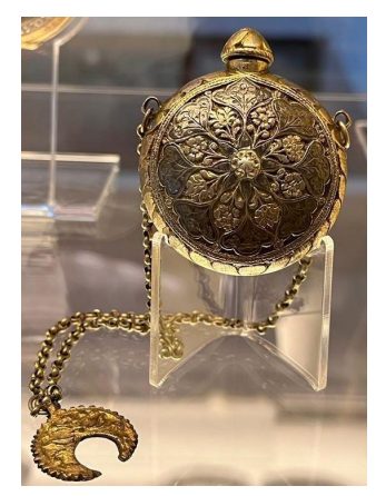
Figure 3. Celak from Islamic Arts Museum Malaysia