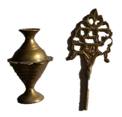
Figure 4. Celak from Personal collector