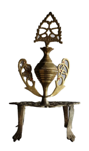
Figure 5. Celak from Personal collector