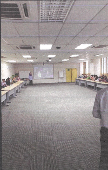
Figure 3 : Women Day