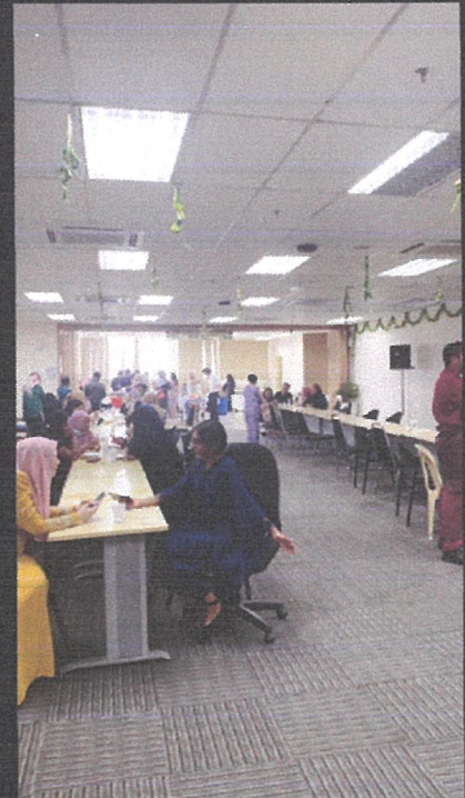
Figure 4 : Hari Raya Tamco