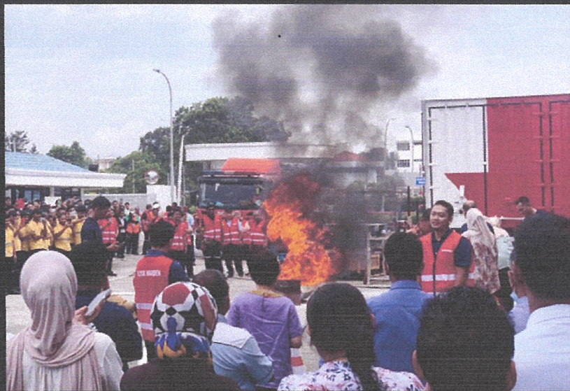
Figure 2 : Fire Drill