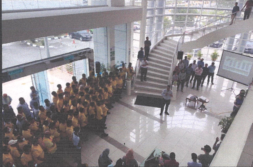
Figure 1 : Townhall Tamco