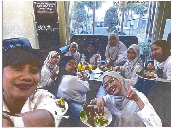
A visit to Jeram Sanitary Landfill