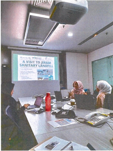
Sharing session with compliance team about the visit to Jeram Hill