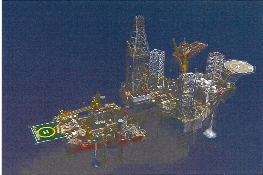
Cendor MOPU (MOBILE OFFSHORE PRODUCTION UNIT)