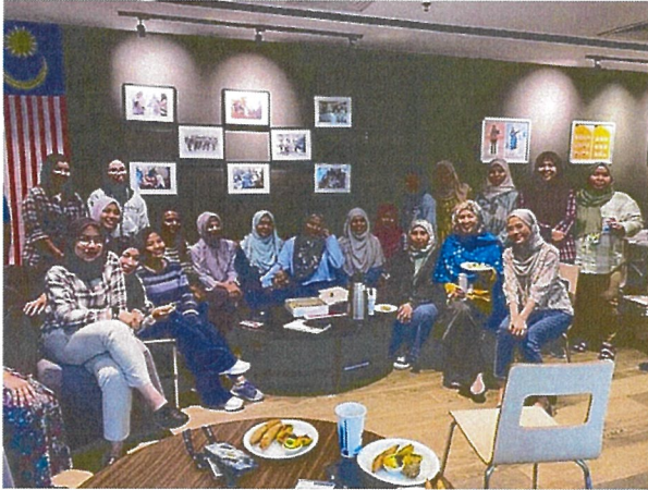
“Coffee Talk with MT” Sharing session with Head of Department Compliance and Continuous Improvement