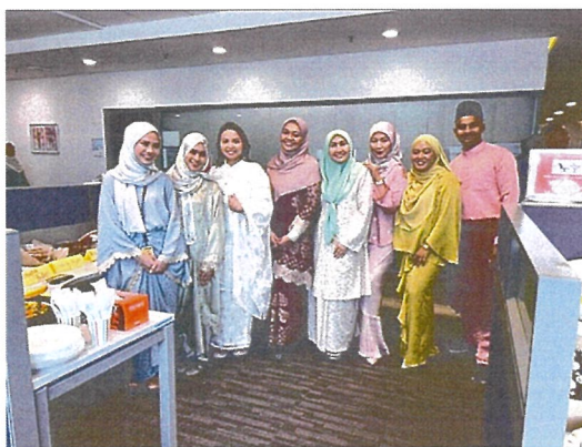
Compliance and Continuous department open house