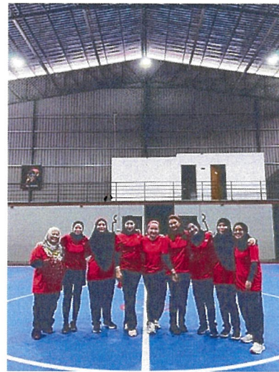
Participated in Netball