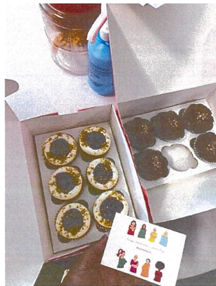
International Women Days Celebration