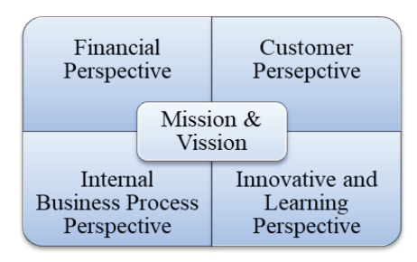
Figure 1: Key Components of BSC (Kaplan, 2009) Source: Kaplan and Norton (1992)

need to take the initiatives that will bring the firm closer to realising its goal. Because it incorporates both internal processes and external issues in its foundation, BSC has been recognised as a valuable management tool (Hladchenko, 2015). Taking into account both quantitative and qualitative information as well as financial and non-financial information, BSC enables a thorough performance measurement (Kopecka, 2015) and translating the corporate plan into action (Senarath & Patabendige, 2015) and operational control systems (Wake, 2013). The BSC component depicted in the Figure 1 presents the quantitative and qualitative measures to formulate a corporate strategy.