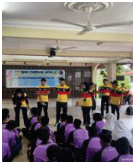
Picture 2: Photo during the event