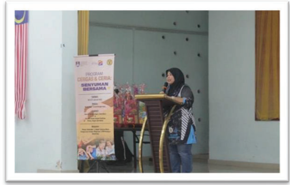
Picture 2: The Principal of Rumah Kanak-Kanak Rembau giving a speech