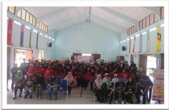
Picture 1: Residents at Rumah Kanak-Kanak Rembau and the organizer