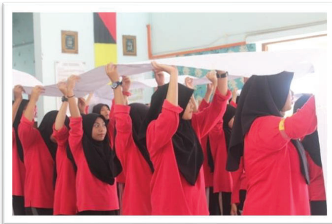
Picture 3: Photos during the event