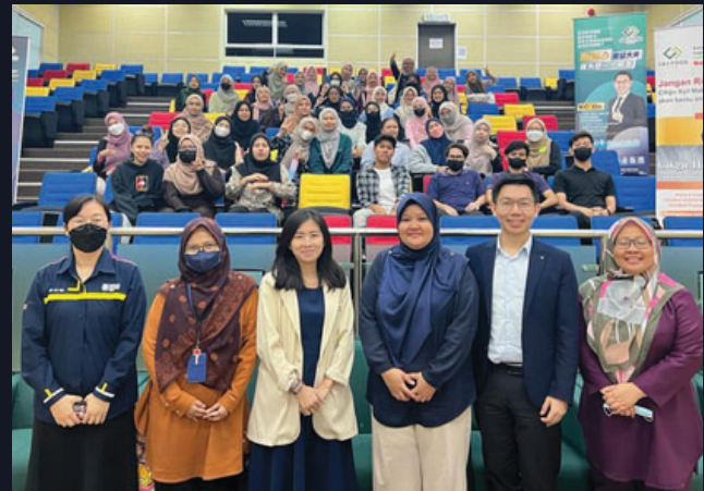
A photo session at the end of the programme

The training program on "Hazard Analysis Critical Control Point (HACCP) Implementation" successfully combined theoretical learning with practical application, fostering a comprehensive understanding of food safety and HACCP principles among students. The acquired knowledge and certification are poised to elevate students' employability prospects within the food manufacturing and services industry. The collaborative effort of UiTM Negeri Sembilan Branch and C&J Food Management Group is commendable, as it contributes to the preparation of industry-ready professionals. As we know, "Empowering Food Safety: Everyone's Responsibility!"