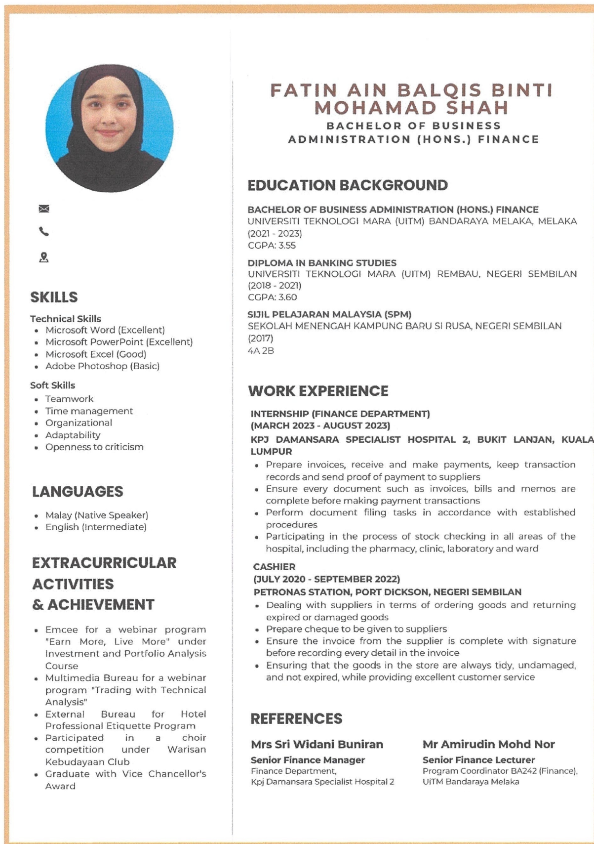
Figure 1: Resume