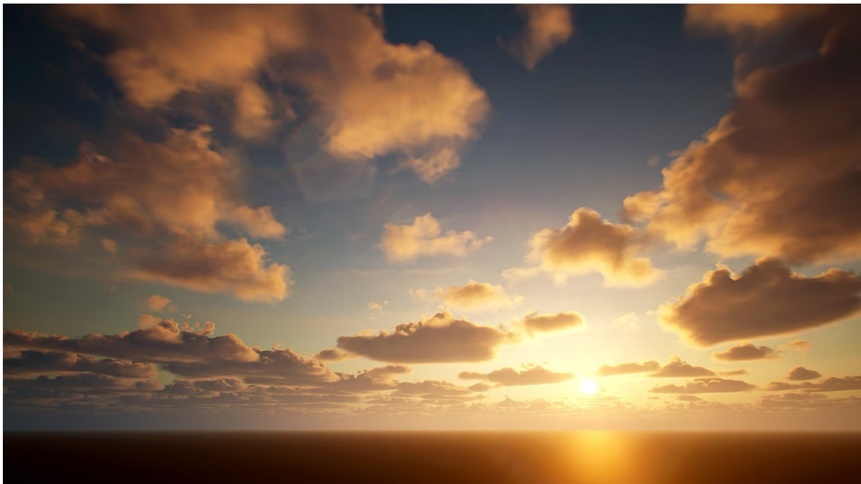
Image by Ultra Dynamic Sky in Blueprint-UE Marketplace

You are to me like the sky Always perpetual and ever beaming as it passes by Comes glee nor darkness You will always be my happiness