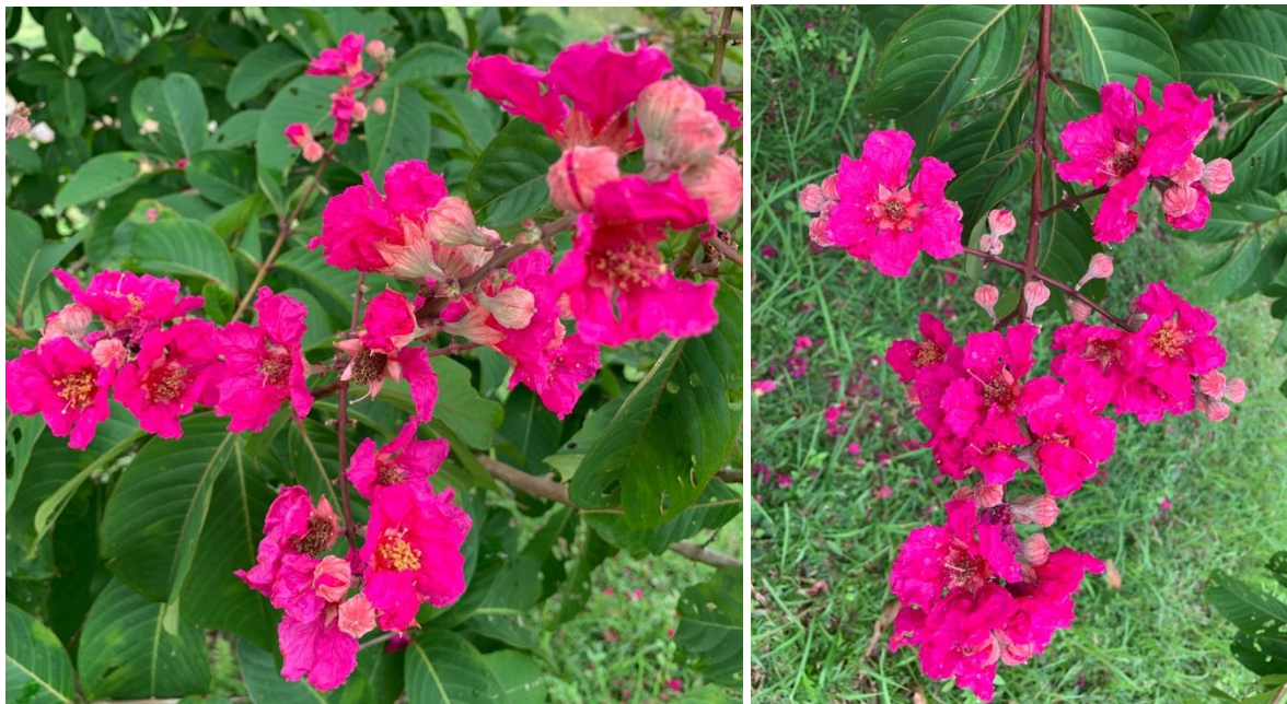
Lagerstroemia indica or the crepe myrtle

What a nice ride around here When I see your sparkling rosy red petals Dancing by the lake Swaying when the wind blows On a sunny morning You make me smile all the way. One day, I will visit you. Wearing my pinky hat Greet you and ready to be amazed. But just before that, let me find out. That you are the crepe myrtle. Should I ask a friend? No Should I refer to a volume? May be. Just scratch my head a little And there I can recognise you. Lagerstroemia indica , You beautify the campus.