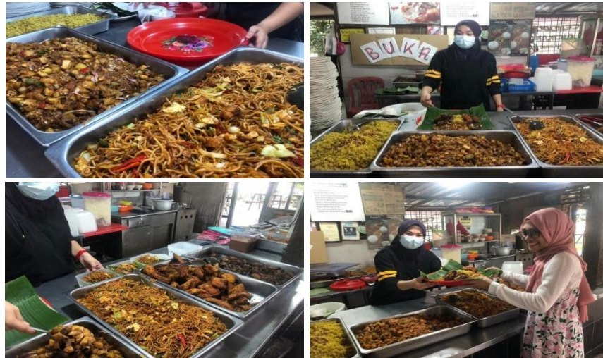
Figure 5: The dishes of Nasi Ambeng at Warung Ibu Nasi Ambeng are put in the food pan inserts and the staff would take each of them for the customers.