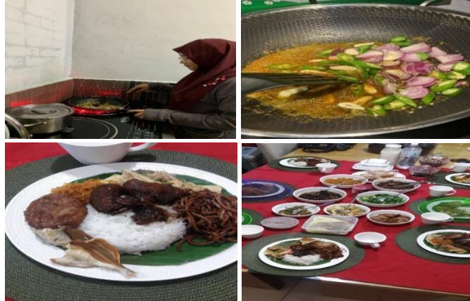
Figure 3: From top, the mother was preparing sambal goreng jawa for Nasi Ambeng by sauteing the ingredients, and from below shows that Nasi Ambeng was plated individually, served, and consumed together within the family.

Family consumption is a social ritual that symbolizes cohesion, closeness, and unity, and it plays a crucial role in strengthening family bonds (Chitakunye & Maclaran, 2008). When it comes to family consumption, Nasi Ambeng can be served and enjoyed on various occasions or even as a daily meal, as it has become a popular choice for any time of the day. However, having a special meal at home over the weekend can be a particularly enjoyable activity, as parents and children can spend time together, engaging in preparation activities and dining as a family. Therefore, in terms of family relationships, sharing meals and engaging in conversations can foster support and connection among family members.