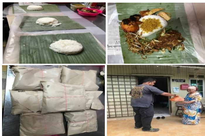
Figure 2: The Nasi Ambeng was individually wrapped by using waterproof wrapper and secured with rubber band, then was given out to the neighbour, friends, and relatives.

Kenduri slametan is executed differently, as hosts usually do not invite jemaah masjid to their house to recite Surah Yaasin and doa selamat for their sick mother, for instance, out of consideration for her health. The kenduri is held on Friday night among family members. Similar to tahlil , Javanese descendants typically serve Nasi Ambeng as the main dish. However, during the kenduri at night, Nasi Ambeng is not served or consumed. Instead, it is prepared and cooked as early as nine in the morning before the kenduri begins. As shown in the figure below, Nasi Ambeng is wrapped in waterproof paper lined with translucent plastic and a banana leaf. Serondeng is placed on top of the white rice, next to mi goreng jawa , sambal goreng jawa , fried chicken, fried tofu and tempeh, and fried salted fish. After the Nasi Ambeng is individually packed, it is distributed to the closest family members, relatives, neighbors, and friends. This practice has continued even during the pandemic.