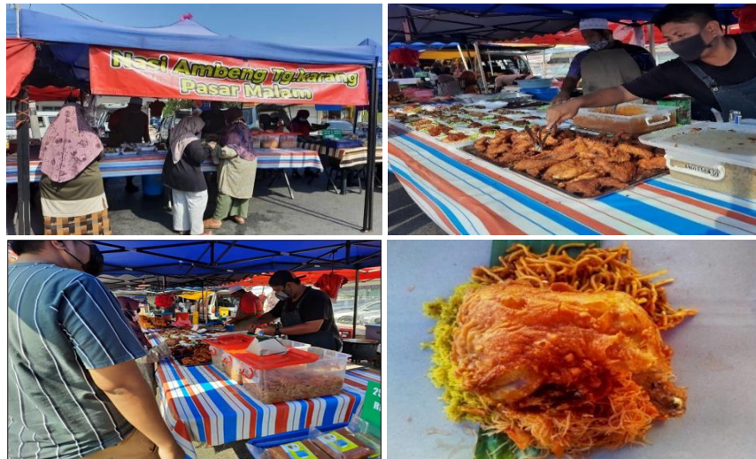
Figure 6: The scenario of the trader selling Nasi Ambeng at night market at Tanjong Karang.

Night markets in Malaysia have long been popular destinations for locals, primarily due to the wide variety of delicacies they offer. The selection of foods available at night markets is considered exceptional and unique, as these markets often reflect distinct characteristics of Malaysia's culture, including the eating habits, people, and demographic diversity. In Pasar Malam Tanjong Karang, Selangor, which operates on Sundays from three in the evening until eleven at night, Nasi Ambeng is sold under the 'Nasi Ambeng Tg. Karang Pasar Malam' tent. At this night market, Nasi Ambeng dishes such as sambal goreng jawa , mi goreng jawa , serondeng kelapa , and fried salted fish are displayed in separate containers, while the fried chickens are arranged on a tray. Nasi Ambeng is not pre-packed but is prepared upon customer's request (see Figure 6). The stall packs Nasi Ambeng in newspaper sheets and a banana leaf, following the traditional Nasi Ambeng wrapping style. However, the outer layers are alternated with commercial waterproof food wrapper sheets to prevent any leaks or spills. Nasi Ambeng is sold at a highly affordable and reasonable price considering the portion size. In summary, the serving of Nasi Ambeng at night markets is practiced as a commercial activity, as vendors sell Nasi Ambeng to generate income and revenue.