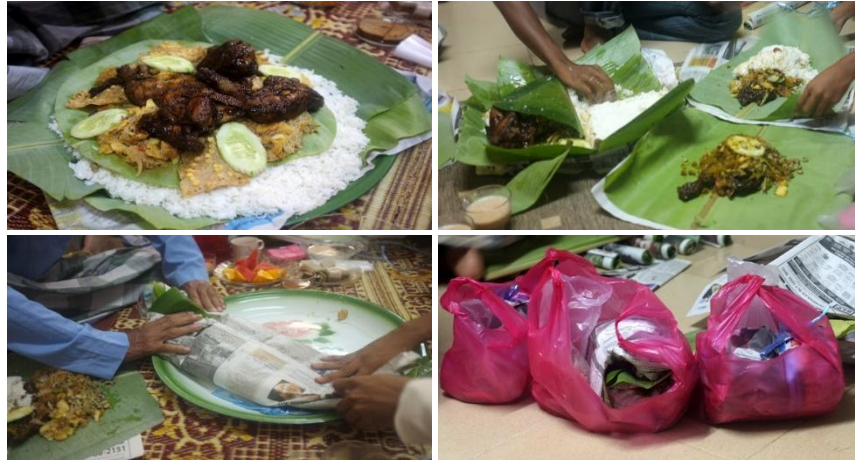
Figure 1: From top, Nasi Ambeng was served in large round tray portioned for four persons, then divided by using hands into individual wrappings.

Kenduri slametan is executed differently, as hosts usually do not invite jemaah masjid to their house to recite Surah Yaasin and doa selamat for their sick mother, for instance, out of consideration for her health. The kenduri is held on Friday night among family members. Similar to tahlil , Javanese descendants typically serve Nasi Ambeng as the main dish. However, during the kenduri at night, Nasi Ambeng is not served or consumed. Instead, it is prepared and cooked as early as nine in the morning before the kenduri begins. As shown in the figure below, Nasi Ambeng is wrapped in waterproof paper lined with translucent plastic and a banana leaf. Serondeng is placed on top of the white rice, next to mi goreng jawa , sambal goreng jawa , fried chicken, fried tofu and tempeh, and fried salted fish. After the Nasi Ambeng is individually packed, it is distributed to the closest family members, relatives, neighbors, and friends. This practice has continued even during the pandemic.