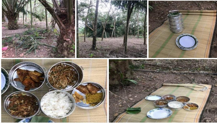
Figure 4: From top left to right was the palm and rubber plantation that were located next to each other and the stainless-steel tiffin as well as mat and plastic plates. After they finished the work, they rest and ate Nasi Ambeng under the shady palm-oil tree.