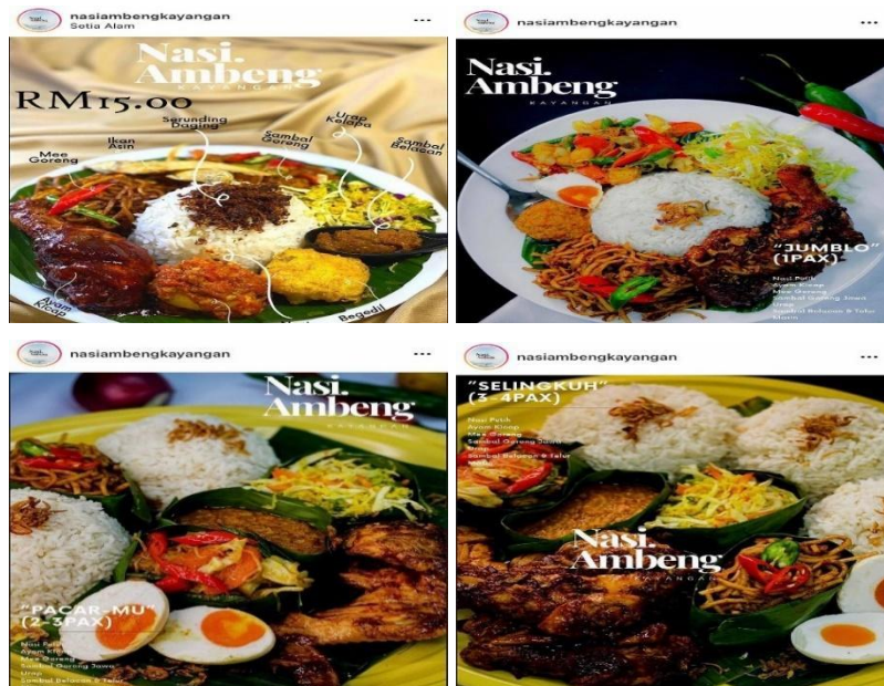
Figure 8: Nasi Ambeng sold in several packages that comprised of different portion and the picture of Nasi Ambeng is posted on Instagram.