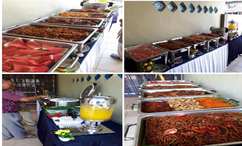
Figure 7: Nasi Ambeng is served in buffet style in the catering service.