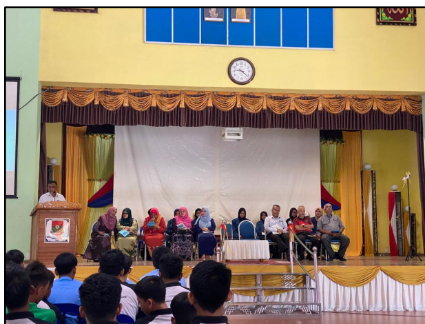
Figure 2: Sharing Session

students to the students of Sekolah Menengah Kebangsaan Pangkal Meleret, welcoming the event with traditional dances to introduce Indonesian culture, presentations about school libraries in Indonesia, presentations about academic (university) libraries in Indonesia, game sessions, and ended with singing together "Laskar Pelangi" to build bonding with students of Sekolah Menengah Kebangsaan Pangkal Meleret.