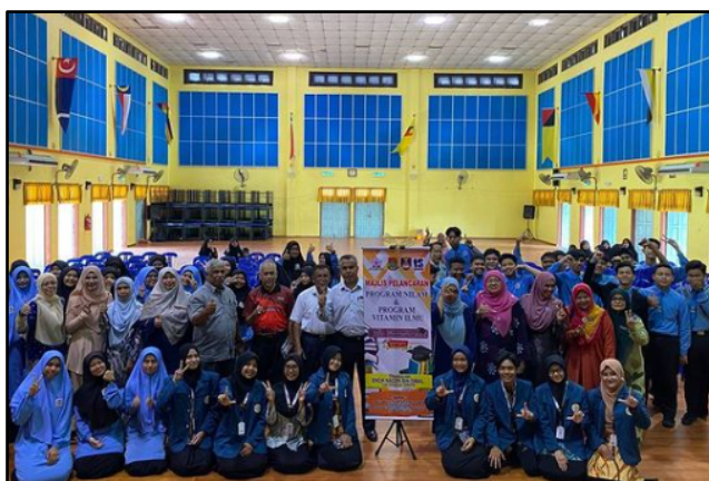
Figure 1: Inauguration of NILAM

The first activity carried out in this program was the inauguration session of the NILAM (Nadi Ilmu Amalan Membaca) program which is a unified reading movement program for all schools in Malaysia. The NILAM program is an approach initiated to address issues related to low reading and literacy habits among students. The aim of the NILAM program is to make students love reading and to encourage schools to maintain creative and innovative ideas in an effort to improve students' reading skills.