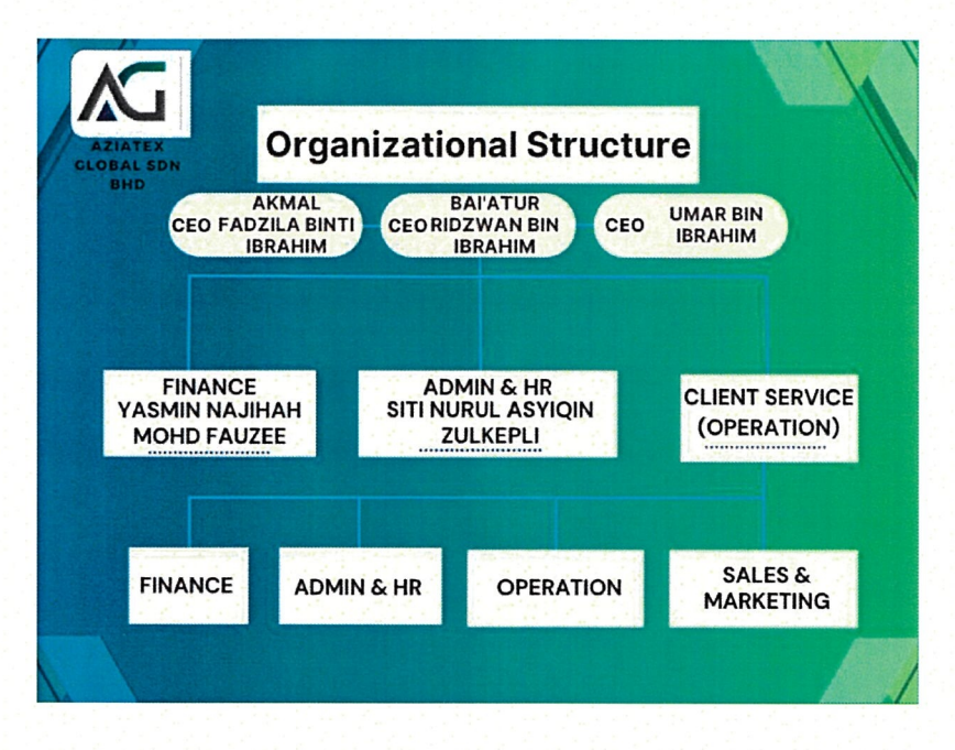
Figure 2.4: Aziatex Global Organizational Structure