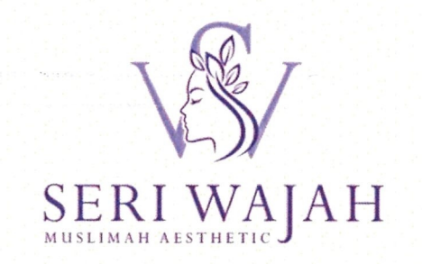
Figure 2.5: Seri Wajah Muslimah Aesthetic

A face beauty center exclusively for Muslim women is called Seri Wajah Muslimah Aesthetic. Our services are used by Seri Wajah Muslimah Aesthetics to interact with consumers through sales and marketing prior to their visit to the spa. In addition to that, we have also