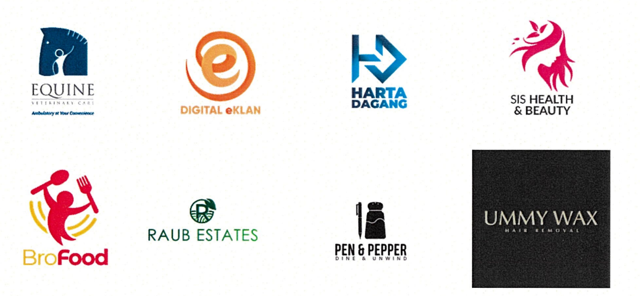
Figure 2.8: Other Clients of Aziatex Global Sdn. Bhd.