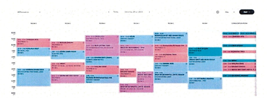
Figure 2.9: Fresha

report, submit it to the OPS group, and open a Get Away Message on WhatsApp before finishing work.