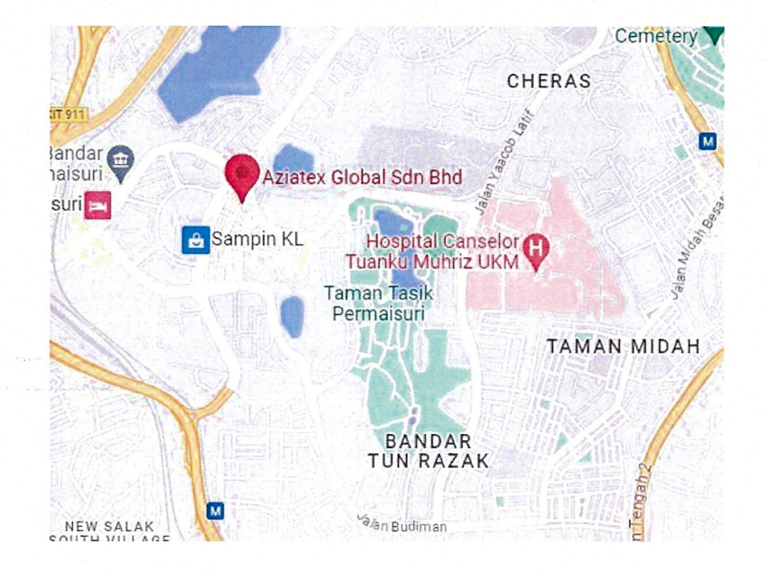
Figure 2.2: Aziatex Global Branches at Kuala Lumpur

The first branches of Aziatex Global Sdn. Bhd. Is located at Third Floor, 102-3, Jalan Dwitasik, Dataran Dwitasik, 56000 Kuala Lumpur, Wilayah Persekutuan Kuala Lumpur.