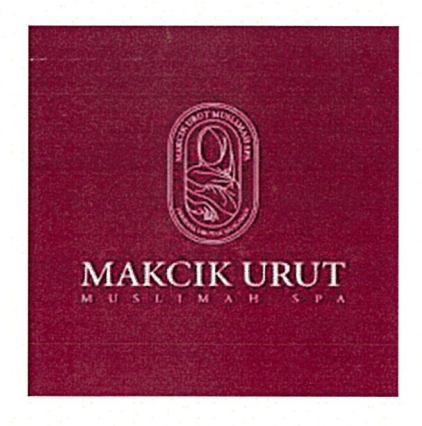
Figure 2.7: Makcik Urut Muslimah Spa