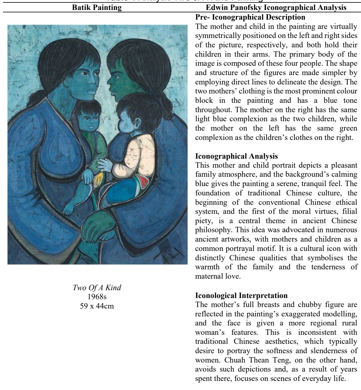
Table 1 Analysis Two of A Kind Painting