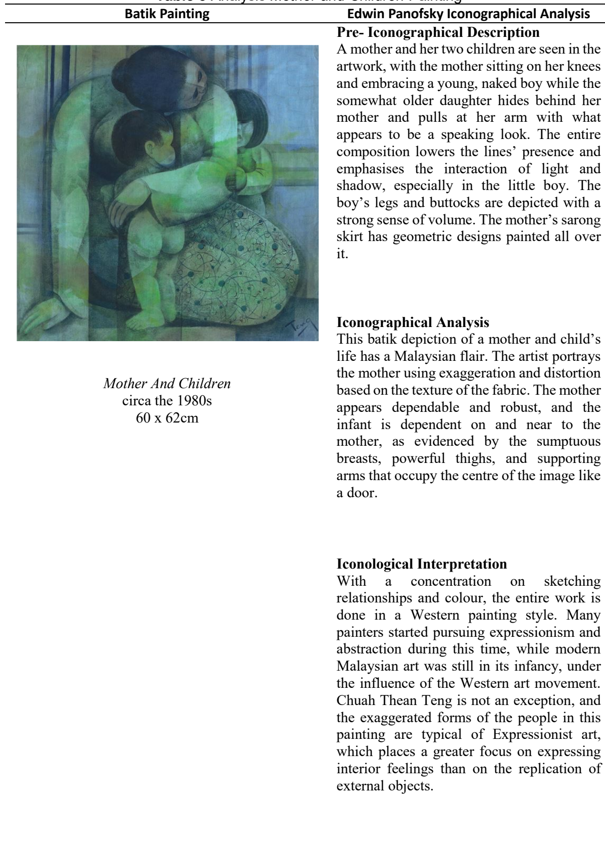
Table 3 Analysis Mother and Children Painting