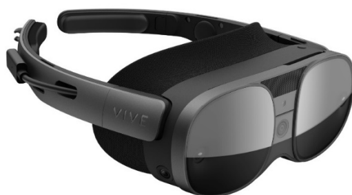
Figure 1 A Virtual Reality headset