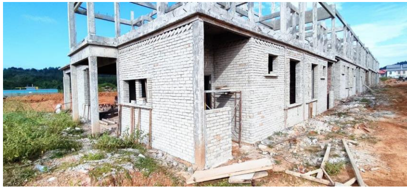
FIGURE 1.3 the exterior wall of the house at 50%