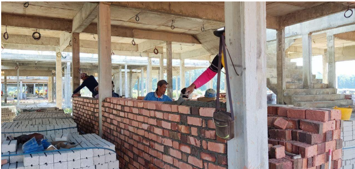
FIGURE 1.0 the process of brick laying for interior wall

The case study is carried out at Simfoni West Taman Tunku Intan Safinaz, Jitra, Kedah. This study is focusing on the brick laying in constructing walls of a 2-storey terrace house and the method using on the construction. the study shows that the process on built the wall took time because of some aspect that cannot be avoid. For instant, the wall should be finished by October 2021, but due to covid lockdown the due date has been delay. But even though they must rush things forward, but the supervisor and the other consultant of the project managed to make the process right on schedule. For example, the bricks came early on site, so they can start construct it on the evening. The study also shows the method that been using for brick laying for interior and exterior walls. For example, the skilled worker is in charge for the brick laying. Only 2 or 3 person that will be doing the laying and 1 person will be responsible on making the cement stays wet like shown in figure 1.0 below.