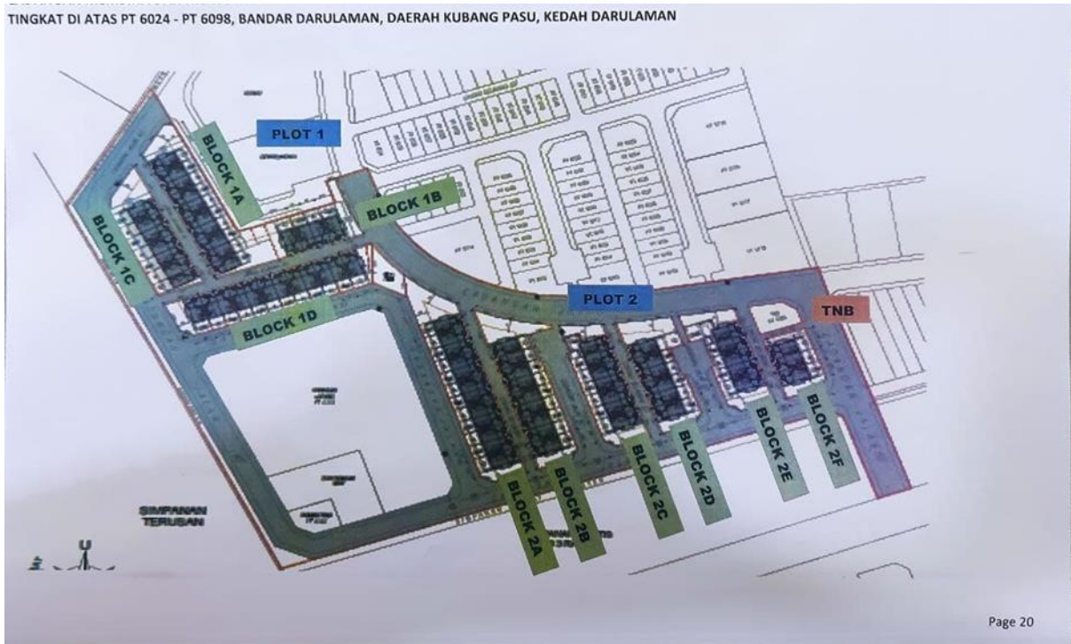
FIGURE 1.5 Site plan