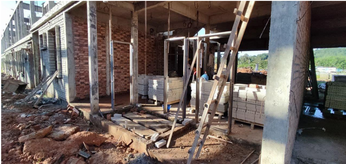
FIGURE 3.2 the ropes and door frame are installed.

For the method of wall construction, I've been observed and collecting data for a few weeks on the process since it began. They used a standard method for brick laying. But before they proceed the brick laying, they already measured the length and width, or the wall and the calculation are 39 x 20 feet. Then they used a thin rope to make string line for the brick laying just like in figure 3.2 below.