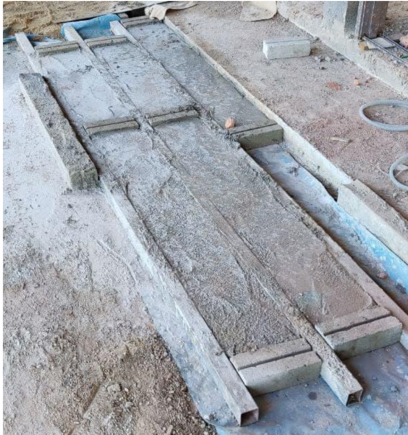
FIGURE 3.8 The slab for the window.

Then they installed the slab in middle of the wall and cement it. They also put a brick below the slab to make it as a temporary holder just for enough time to let the cement hardened like the figure 3.6 below.