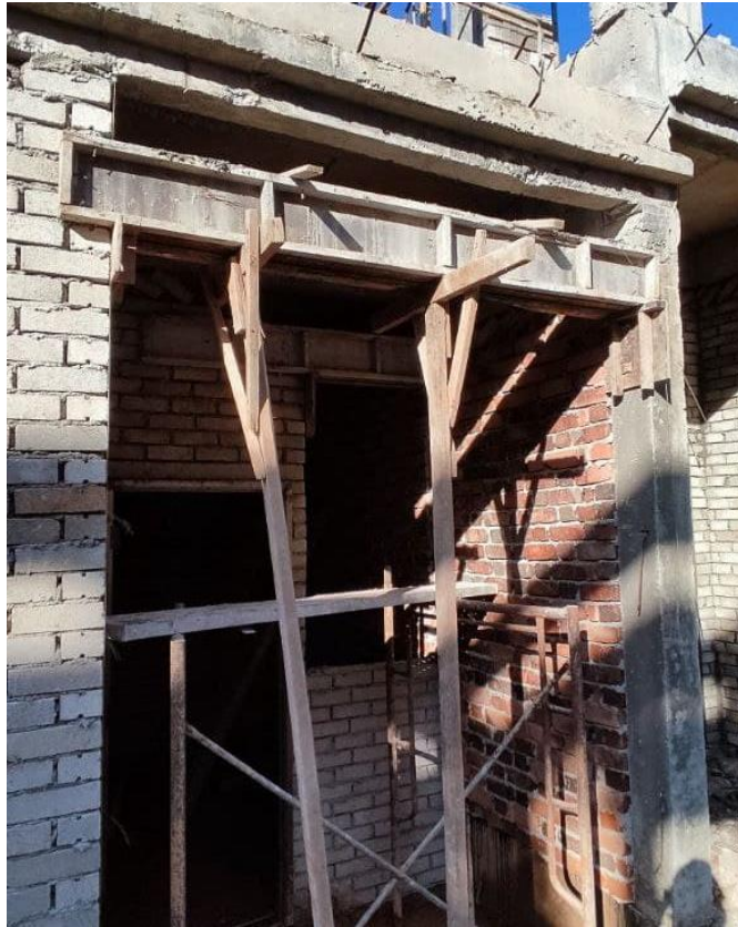
FIGURE 3.7 the formwork of the beam

After almost a month the ground floor wall of house lot 2C,2D, and 2E has finished. Like shown in figure 3.8.