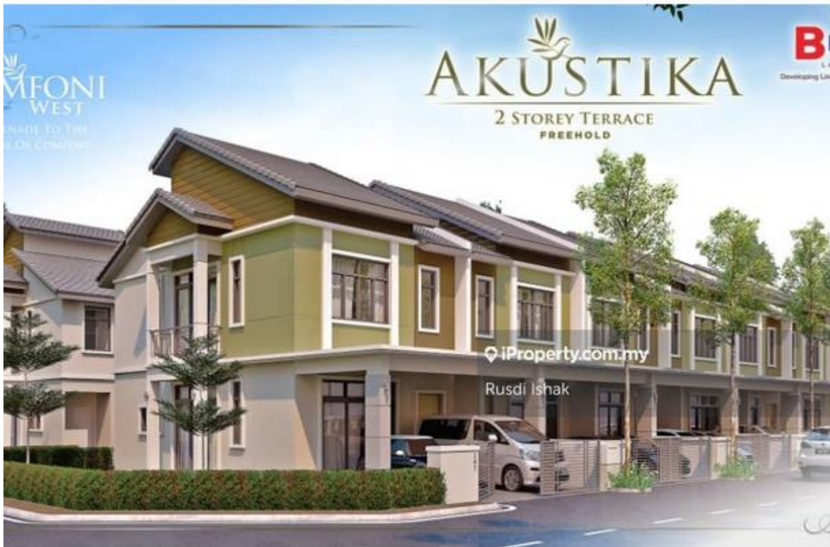
FIGURE 3.0 the house design for Akustika

Based on the figure 2.0 above, this is the ongoing project that started on 7 th of September 2020 which Simfoni West phase 5b (Akustika). It is a 2-storey terrace house and it's located at PT 6098, Bandar Darulaman, Daerah Kubang Pasu, Kedah Darulaman. This project commences on 7 th September 2020, but due to covid lockdown in May 2021, it must stop for a few months. After a long delay the project is back on track in October 2021 and working smoothly. Yan Gap Construction Sdn. Bhd who is the paid contractor that managed the project and Bdb Land Sdn. Bhd as the company client. The contract period for this project is for 18 months, and the completion date already being given which is 6 th March 2022. Also, there are executive consultant for this project, Jamil Architect who works on the architect