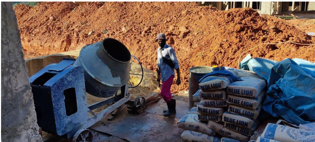
FIGURE 1.2 the labour is mixing the cement for the brick laying

But some of construction work has been done by the labours, such as making a small slab for the windows, tying the rope for the brick laying and of course building the foundation of the house.