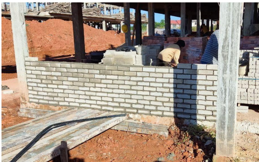
FIGURE 3.7 bricklaying the exterior wall

During the exterior wall process, they also do the window. First, they make small slab for steel windows and 1 long slab glass panel on the process like in figure 3.5.