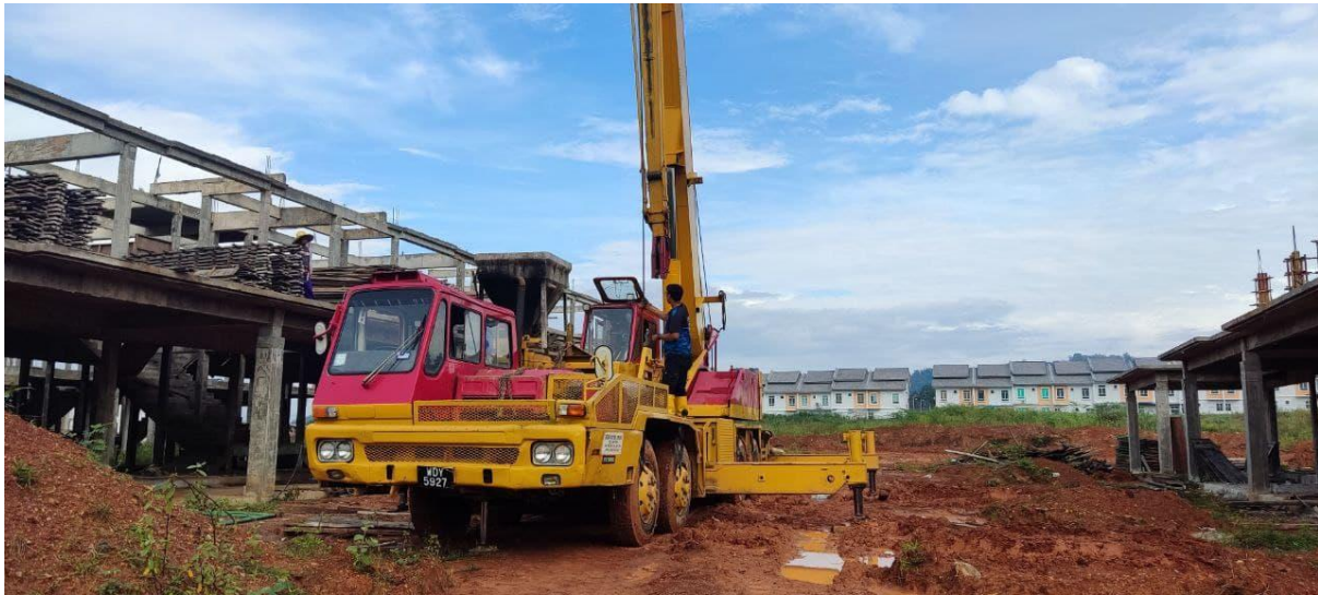
FIGURE 1.1 the pulley transferring the bricks on site

They use only 2 machineries, a pulley for transporting the bricks and a cement mixer like shown on figure 1.1 and 1.2 below.