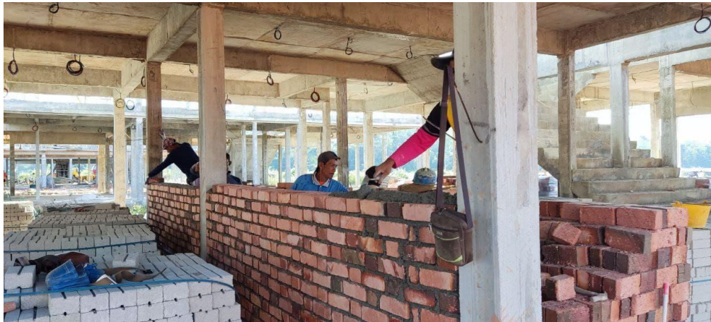
FIGURE 3.6 bricklaying the interior wall

For interior wall they used a standard red brick and exterior wall uses cement brick. They used stretcher bonds bricklaying method. Of course, the bricks are arranged one by one, layer by layer just like in figure 3.4 and 3.5 below