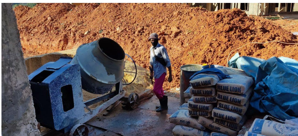
FIGURE 3.3 the worker is mixing the mixture

From each room section a nail was pegged inside the floor slab and first floor slab. Then they tied the string from up and down, left to right. After that, they started mixing the concrete using of course the concrete mixer. They used a wet cement just a mixture of sand, cement and water. It shown at figure 3.3 below