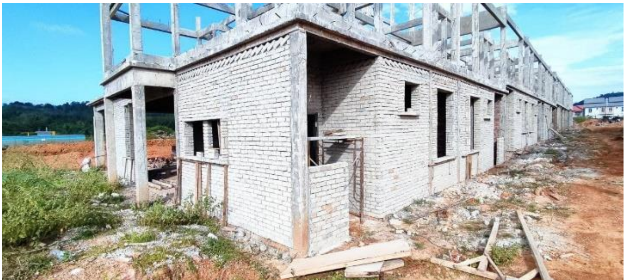
FIGURE 3.8 the ground floor walls

After almost a month the ground floor wall of house lot 2C,2D, and 2E has finished. Like shown in figure 3.8.