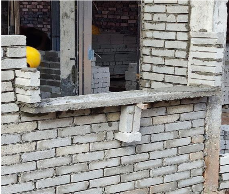
FIGURE 3.6 the process of making window

After they finished the windows section, they began installing walls on the door section. Before they arranged the bricks, they made a long beam and left a small gap above it. The process has been recorded by photographic like shown in figure 3.7