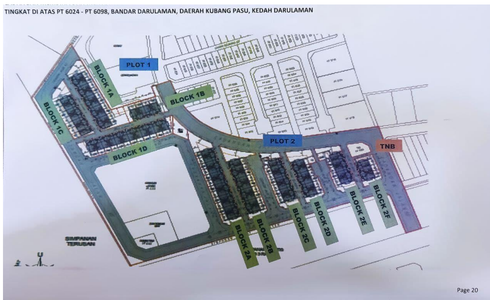
FIGURE 3.1 site plan for akustika

Based on the early report of the project, it contains 6 blocks with 75 unit of 2 storey houses on PT6024 to PT 6098 like in the site plan shown on figure 2.1. The PT is referred to house lot.