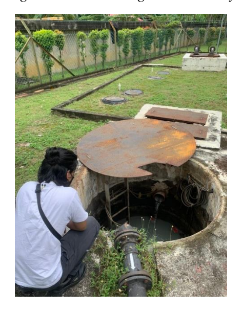
Figure 3.2b checking and inspection sewage treatment plant