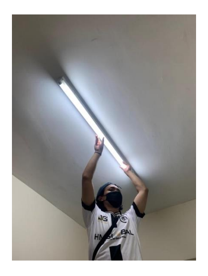
Figure 3.2d replaces new the fluorescent light