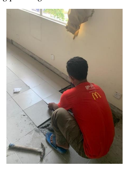
Figure 3.2h installation new tiles