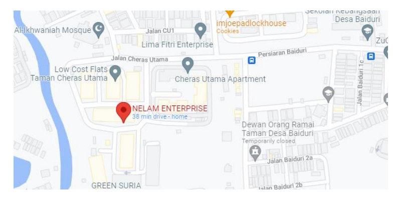
Figure 2.2 company headquarters office

This company provide electrical and mechanical as a main contractor. All the workers are local people and malay. This company also give job opportunities to all people around. Most of the contractor are age around 18-26 which is student and university graduate have been given opportunity to handle the project.