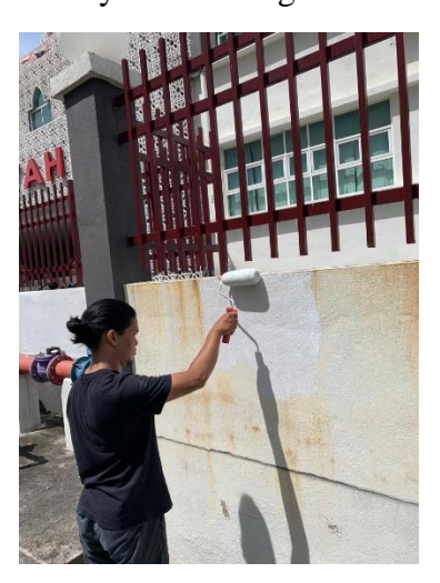
Figure 3.2g painting work to enhance building looks