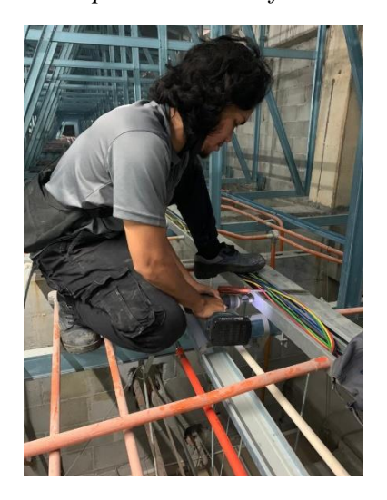
Figure 3.2e wiring work