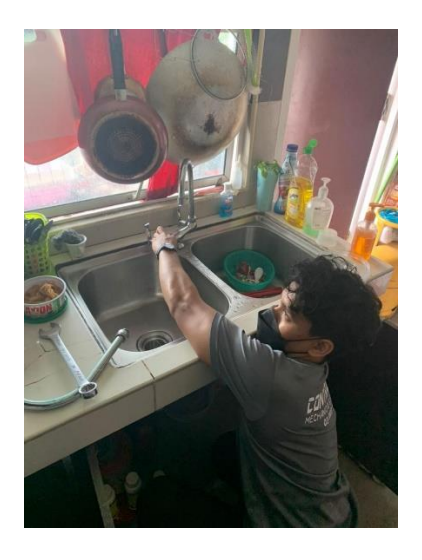
Figure 3.2i installation new water faucet

All of the item on above is checklist for building maintenance work. Mechanical aspect mostly needs to services monthly. Civil and electrical work sometimes there are unknown condition. Then, the technician needs to check and inspection all the building part to know there are some problems or no. sometimes client or people in the building can inform to the technician about defect or anything broken.