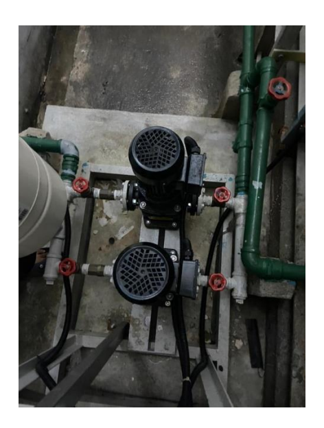
Figure 3.2c water booster pump checking and services