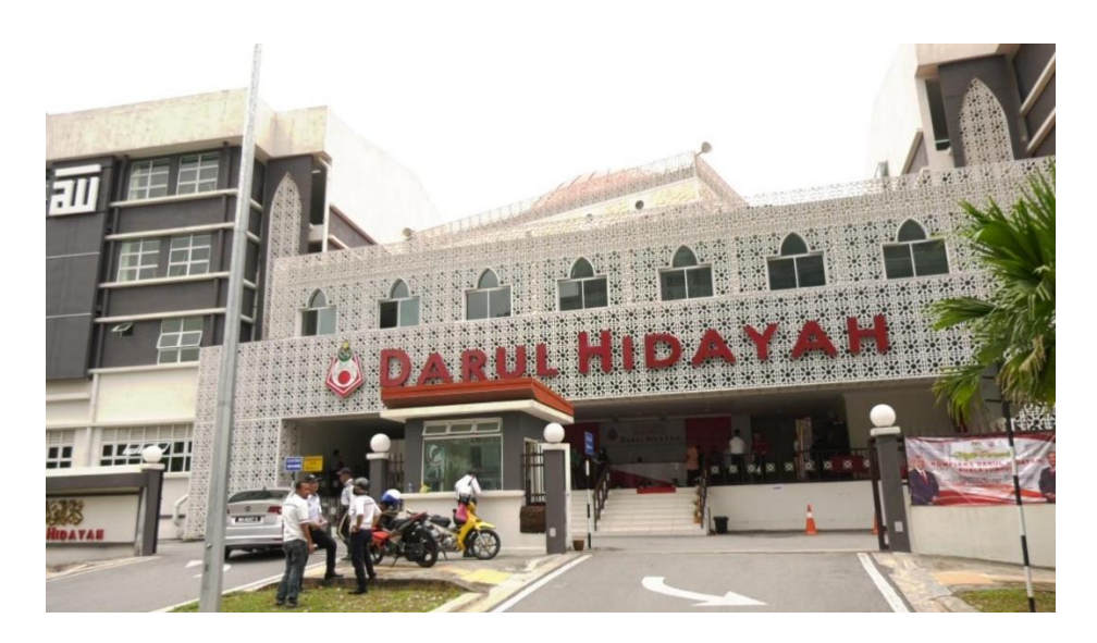
Figure 3.1 site area

Majlis Agama Islam Wilayah Persekutuan was assigned ZZ Megatech Systems SDN BHD as a contractor for Building Maintenance. The project site located at Jalan Sentul Pasar, Mukim Setapak, 51200 Kuala Lumpur. This building name Kompleks Darul Hidayah. The objective for this building is provide residence dormitory for people who convert their religious to Islam. The initiative for this building to give place for them to provide food and religious class. This people called 'Muallaf'. The project already carried out on 1st March 2021 until 28th February 2022. The agreement with client and project manager deal with a year contract. The quotation is total RM600000.00 (Six Hundred Thousand).