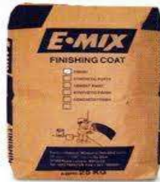
Figure 3.3: Finishing compound

Finishing compound will be used on top of the based coat. Usually it being applied 1 layer according to the needs. Water are being needed to make the solution of this compound. This coat is being used to smoothen the rough surface of based compound and act as finishing surface of the wall.