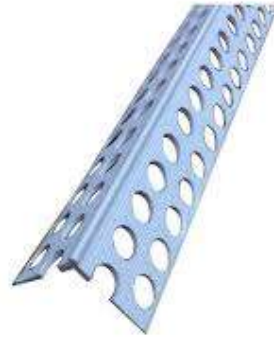
Figure 3.5: Corner Bead.

Corner Bead is one of the important things that be used in skim coating process. Without used of this material the edge of the wall cannot be trimmed smoothly and can give straight effect. Usually there are several design and size that be used depends on the thickness of skim coat.