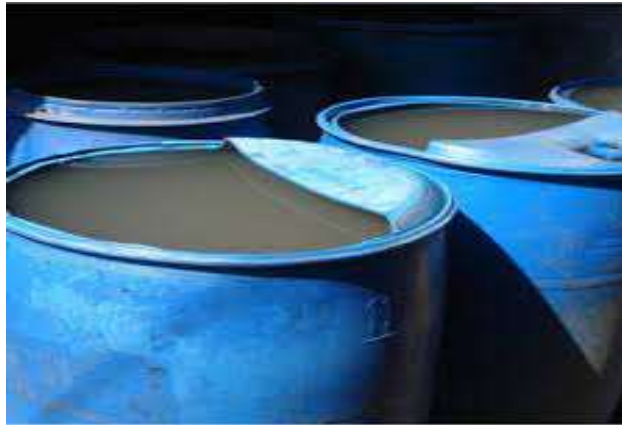
Figure 3.4: Water used for dilute the compound.

Water is one of the materials that is used to dilute the skim coat compound. It is important to use the right amount of water to get the right consistency of the solution. Hardened properties of skim coat are controlled by the amount of water in it including workability, compressive strengths, permeability, durability, and weathering, drying shrinkage, and cracking potential.