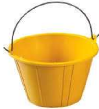
Figure 3.8: Bucket used in the plastering work.

Bucket is used to deliver the mixture of skim coat and for mixing the compound. Bucket is also use make ease for the labor to transfer the mixture from place to other place.. It also come with handle grip and it make from pvc.