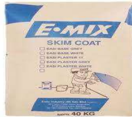
Figure 3.1: Based Compound for Skim Coat.

Based Compound is the based layer for skim coating process. Based compound is being used to close and fill up all the gap. Based coat is being applied on top of plaster surface. This type of compound usually will built up a rough surface.