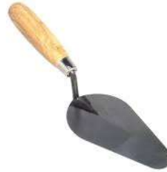
Figure 3.9: Trowel used in skim coating.

The trowel blade is made from steel and also known as point-nosed trowel will make it easy to mix the material of because of the blade shape. Trowels are used in applying the compound.