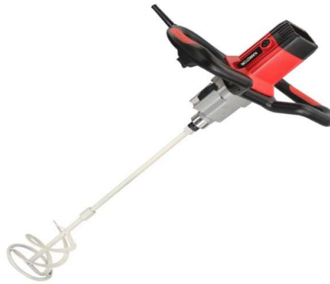
Figure 3.6: Hand mixer machine.

Shovels are one of the hand tools that are used in the plastering work to move the sand, gravel and the concrete that has been produce from one spot to another. Furthermore, it is also used to mix the sand, gravel, cement, and water to produce the concrete. Shovel blades are made from steel that are very strong and the shaft are made from the metal and complete with handle grip that will make it easy to lift the material.