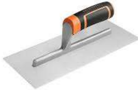
Figure 3.10: Finishing trowel .

Figure above show the finishing trowel that being used to apply and smooth the skim coat either based compound or finishing compound. Other than than, finishing trowel is also being used to level the skim coat for perfect finishing. This trowel also come with edge of blade will make east to labor to applied the skim coat on the wall.