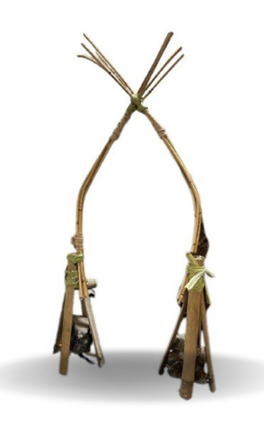
'KANYON GATEWAY' Mix media 60 cm x 30 cm x 18cm 2023

The sculpture is a testament to the harmonious union of artistic expression and environmental consciousness, crafted by skilled artisans who understand the inherent value of sustainable materials. The Gunungan motif represents the sacred mountain and symbolizes the cycle of life. Each curve and contour of the sculpture's form is meticulously carved, capturing the essence of the Gunungan with precision and reverence. The sculpture's eco-conscious creation and sustainable materials remind us of our responsibility to the environment and the potential for artistic expression to contribute to a greener future. Beyond its aesthetic appeal, this bamboo sculpture carries a more profound message, encouraging us to reflect on our relationship with the environment and prompting us to seek innovative ways to preserve our planet's resources while celebrating our diverse cultural heritage.