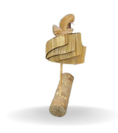
'KERIS DAN TENGKOLOK' Mix media 40 cm x 17 cm x 18 cm 2023

The artist highlights the significance of the 'Keris' and 'Tengkolok' in Malay culture. The Keris is more than just a weapon; it is a work of art that requires a long and diligent manufacturing process. It is highly valued for its beauty, and people with high artistic taste will appreciate it as a valuable cultural artefact. The Keris is also a unique cultural heritage of the archipelago and the Malays, and it has spread to other areas in Southeast Asia with a Malay cultural base. Similarly, Tengkolok has a long and rich history back to the Malacca Malay Sultanate. It was created as a way for commoners to cover their heads or tie their long hair neatly when facing the king. Over time, the cloth tie became more beautiful and was processed and modified according to the level of the wearer. Today, the Tengkolok is used more in ceremonies full of customs, such as being worn by royal relatives or attendees in royal ceremonies. The artist's sculpture showcases the high historical value of these ornaments, which are a glory to the Malay nation. By choosing these two symbols of splendour, the artist is paying homage to the rich cultural heritage of the Malays and highlighting their beauty and significance to the world.