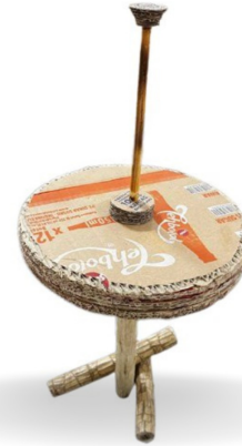
'GASING URI' Mixed media 25cm x 25cm x 50cm 2023

Gasing is a traditional game that is iconic in both Malaysia and Indonesia. In Malaysia, the conventional gasing known as 'Gasing Uri' is made in Kelantan and is recognized for its unique shape and ability to spin for a long time. Similarly, 'Gasing Raksasa' is a well-known traditional game in Bali. Both of these individual Gasing have significant cultural identities in their respective countries. The sculpture incorporates robust features of 'Gasing Uri' with a touch of Gasing Raksasa to represent the collaboration between the two countries. The sculpture emphasizes balance to showcase the exceptional craftsmanship involved in making Gasing, as they are made almost perfectly to stand and spin consistently. The primary material used in the sculpture is cardboard from Teh Botol, a famous beverage in Bali, to highlight Indonesia's contribution to the collaboration.