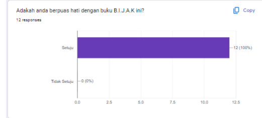
Feedback for “B.I.J.A.K V.1” 1