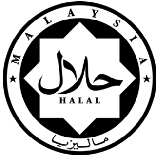
Figure 6.3.1: Halal Jakim Logo