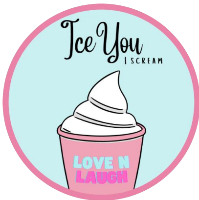
Figure 6.3.3: IceYou logo