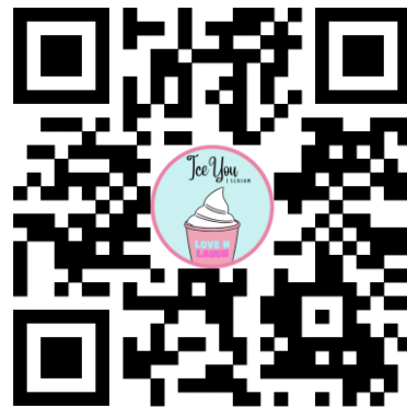
Figure 6.3.4: QR code