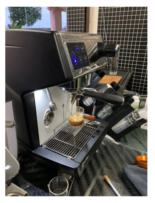
Figure 5: The machine brews the powder coffee beans into espresso