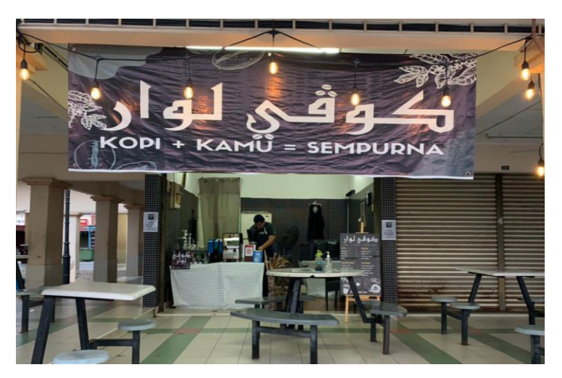
Figure 2: Kopi Luar Café at Ipoh, Perak