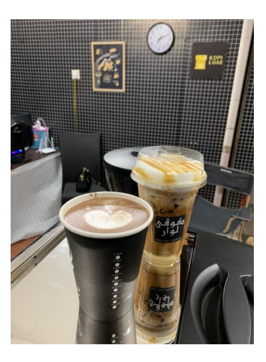
Figure 11: Hot chocolate & Caramel Macchiato