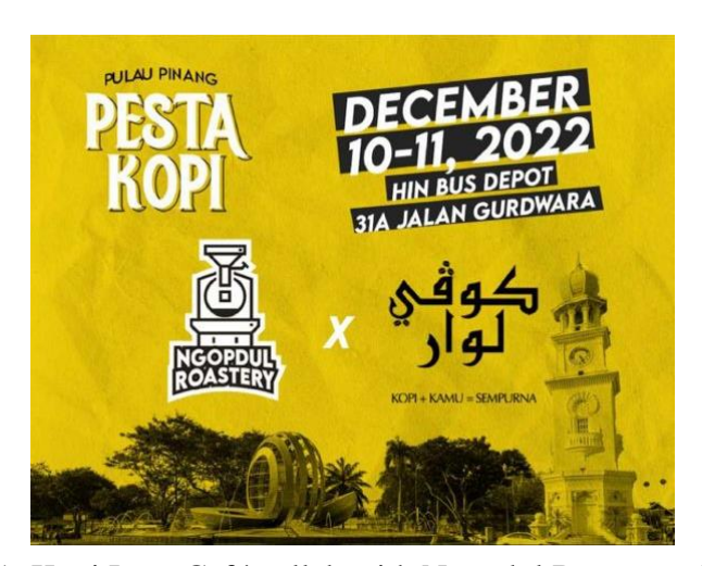
Figure 1: Kopi Luar Café collab with Ngopdul Roaster at Pesta Kopi