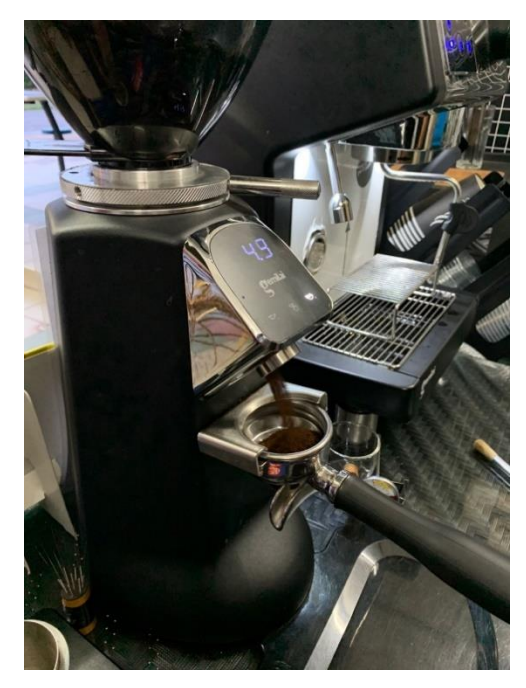
Figure 4: The machine grinding coffee beans