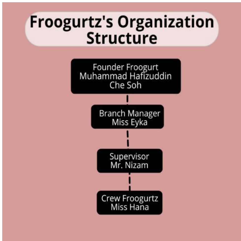
Figure 1.1 : Froogurtz’s Organizational structure