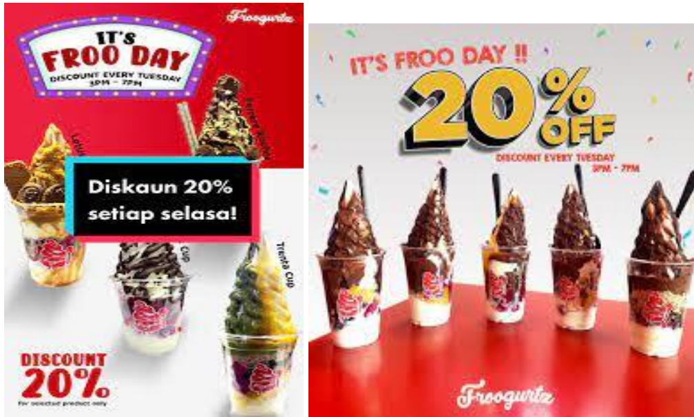
Figure 1.5: Shows that promotion will be available every Tuesday from 3 pm until 7 pm. And it was called “Froo Day”.