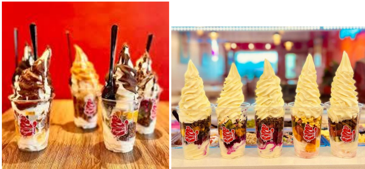
Figure 1.6: Figure above shows the various type of menu and product that available in Froogurtz.