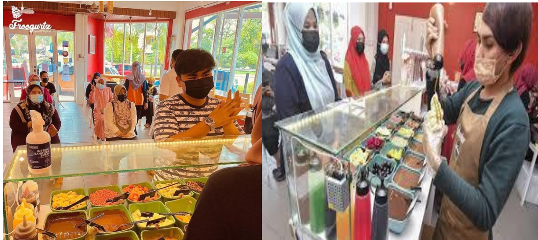
Figure 1.3 : Customers are ordering their order at the Froogurtz outlet order counter.