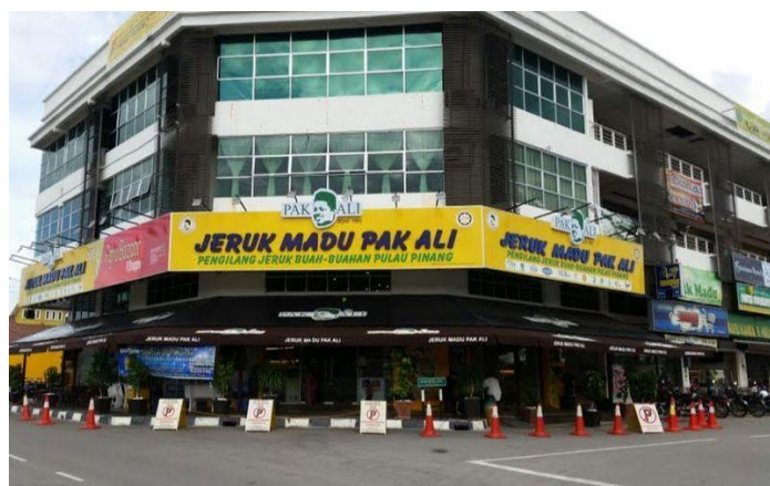
Figure 20: Jeruk Madu Pak Ali's outlet in Penang