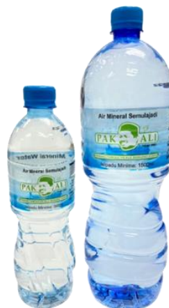
Figure 10: Mineral Bottle