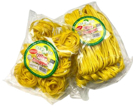
Figure 12: Mee Sanggul