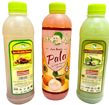
Figure 5: Fruit Juice