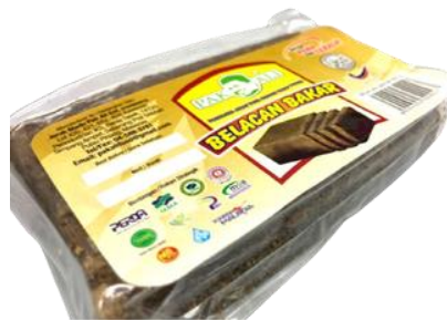
Figure 13: Belacan Bakar