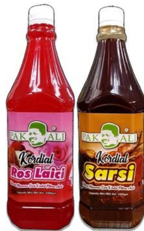
Figure 8: Kordial