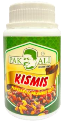
Figure 14: Kismis