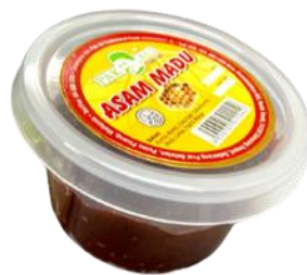
Figure 6: Asam Madu