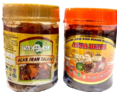
Figure 7: Acar