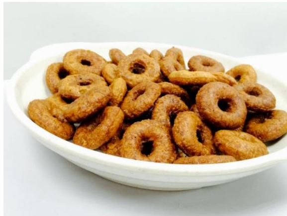
Figure 15: Peneram