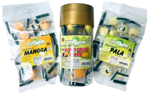
Figure 11: Fruit Candy