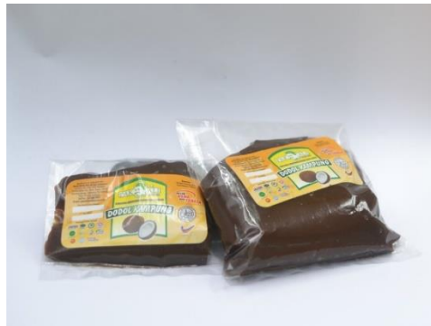
Figure 3: Dodol