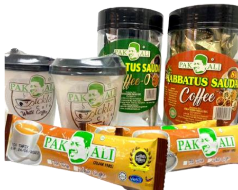
Figure 9: Instant Drink