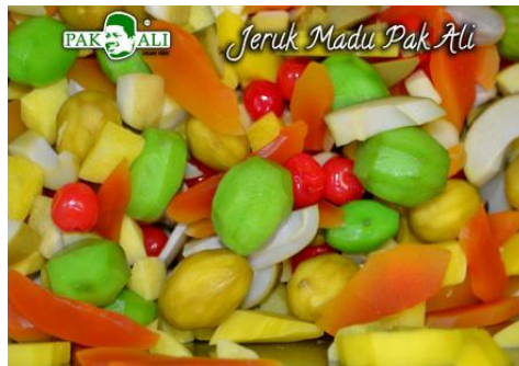
Figure 2: Fruity Pickles