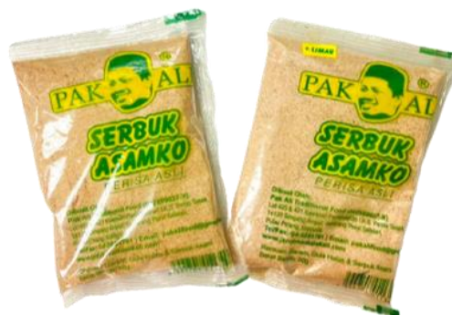
Figure 4: Serbuk Asamko