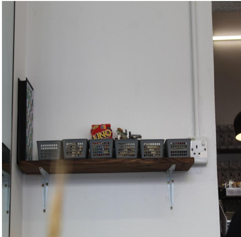
Figure 9.0 Games rack