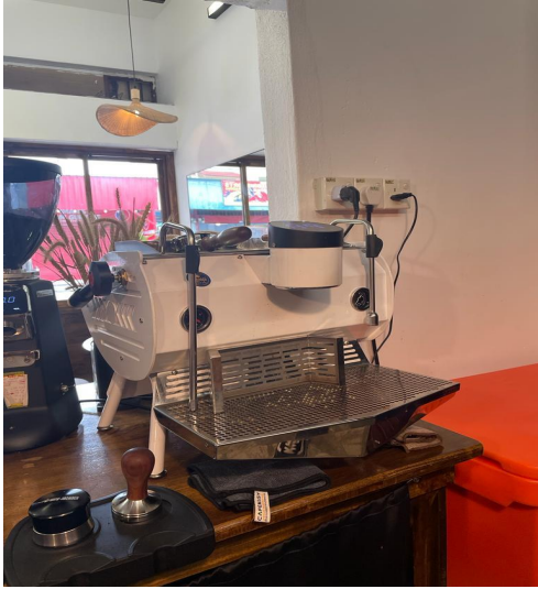
Figure 6.0 Espresso machine