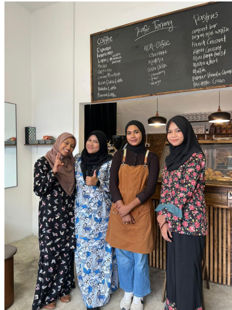
Figure 4.0 Interview with the manager of Kafe Tenang