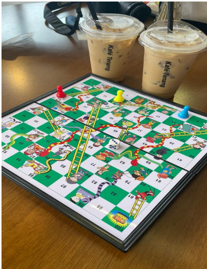
Figure 8.0 Kafe Tenang's coffee and activity