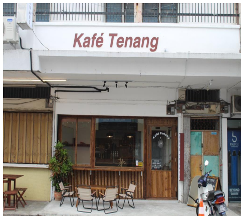
Figure 4.0 Kafe Tenang