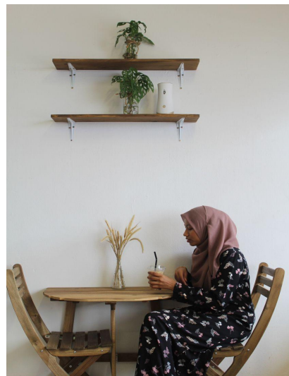
Figure 5.0 Kafe Tenang's decoration