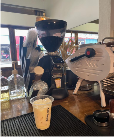
Figure 7.0 Grinder machine