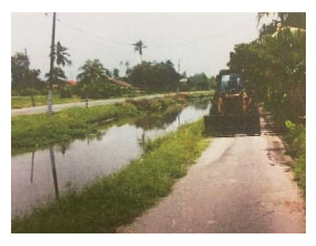
Figure 3.9: A backhoe cleaning the side road from grass