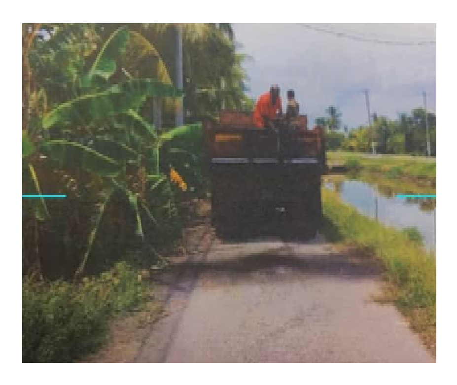
Figure 3.12: Worker spraying bitumen