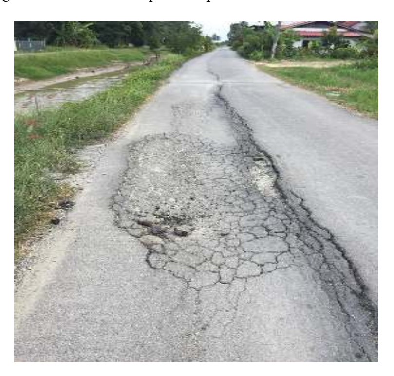
Figure 3.8: Road damages

First step, the contractor ride a motorcycle along the road while marking any damage found using a spray paint. The road was closed to prevent from public enter the working area. Set up the position all of the machinery and lorries because village roads are small and narrow, without perfect planning it will difficult the job. A backhoe come first to clean the road include cleaning the side road from grass. Then, lorries will come and pour crusher run on the road from the starting point that have been marked until the end of the marked road. The backhoe start levelling the crusher run more than 75mm thick because the thick of the crusher run will decrease after compacted by roller. The crusher run have been compacted after that using a 6 ton roller. Spraying 4 liter/meter square bitumen to all of the crusher run and 1.4 liter/meter square on the surface to act as a binder between the crusher run and the premix. Paver pouring the premix asphaltic concrete wearing course (ACWC) 50mm thick on the road after has been filled by a lorry. The premix compacted by 6 ton roller after that. Then, this project done and waiting for coring test to determine is it pass the qualification or not.