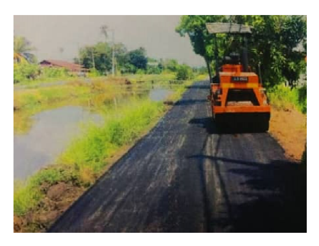
Figure 3.10: A roller compact the premix