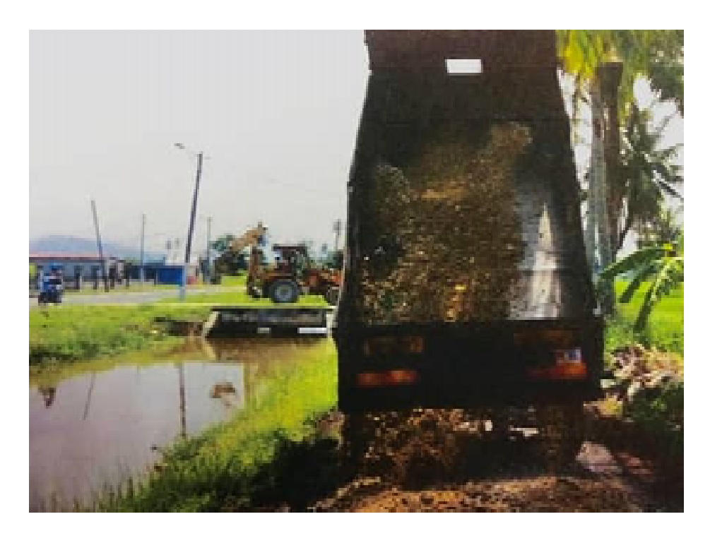
Figure 3.11: A lorry pour the crusher run on road