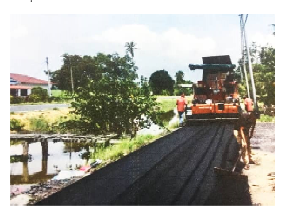
Figure 3.5: A paver

A paver is a famous machinery in road construction work. It is use to lay asphalt on roads, bridges, parking lots and other such places. It lays the asphalt flat and provides minor compaction.