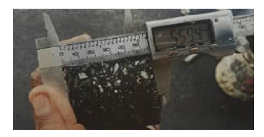
Figure 3.14: The coring reading