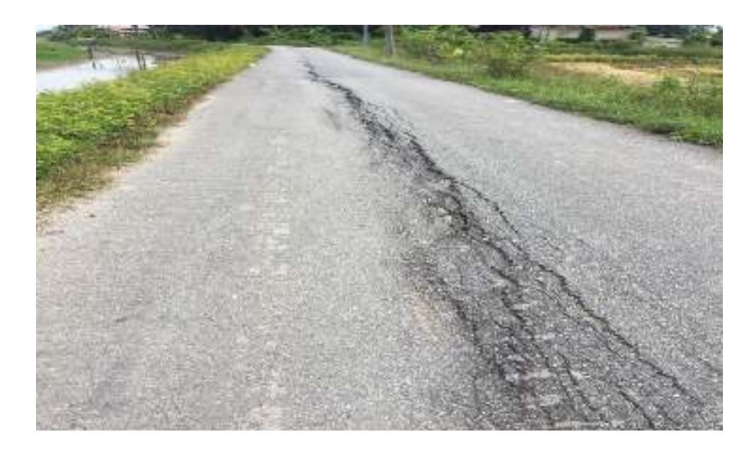
Figure 3.2: Depression of road