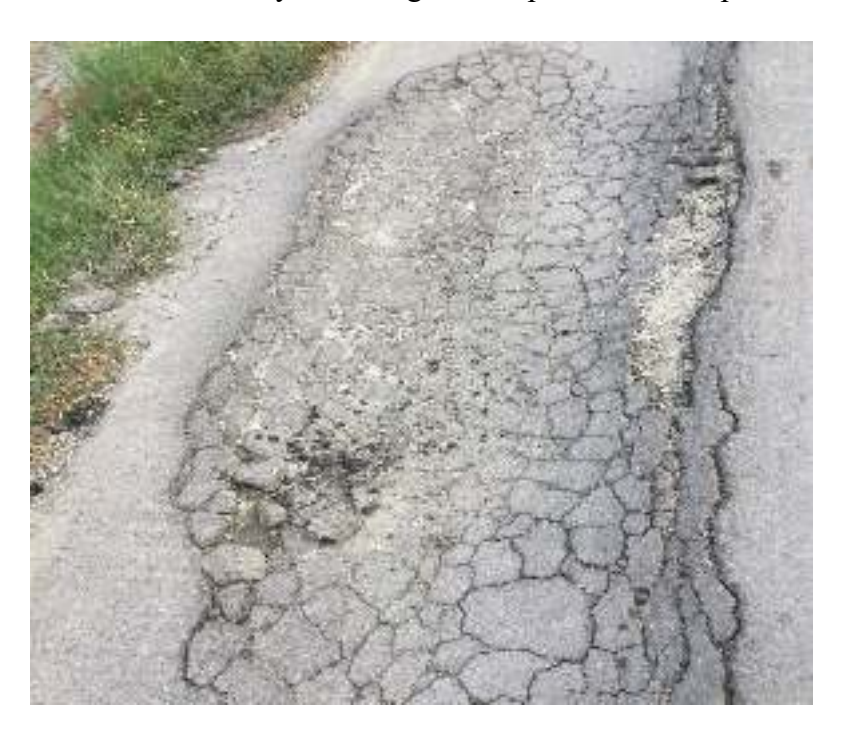
Figure 3.1: road cracking

Cracking happen because of failure the premix surface. There are some factors which cause this happen, firstly because of the road receive too much load which is from heavy transport or machinery. Then, it also can affect by the change of temperature in the premix.