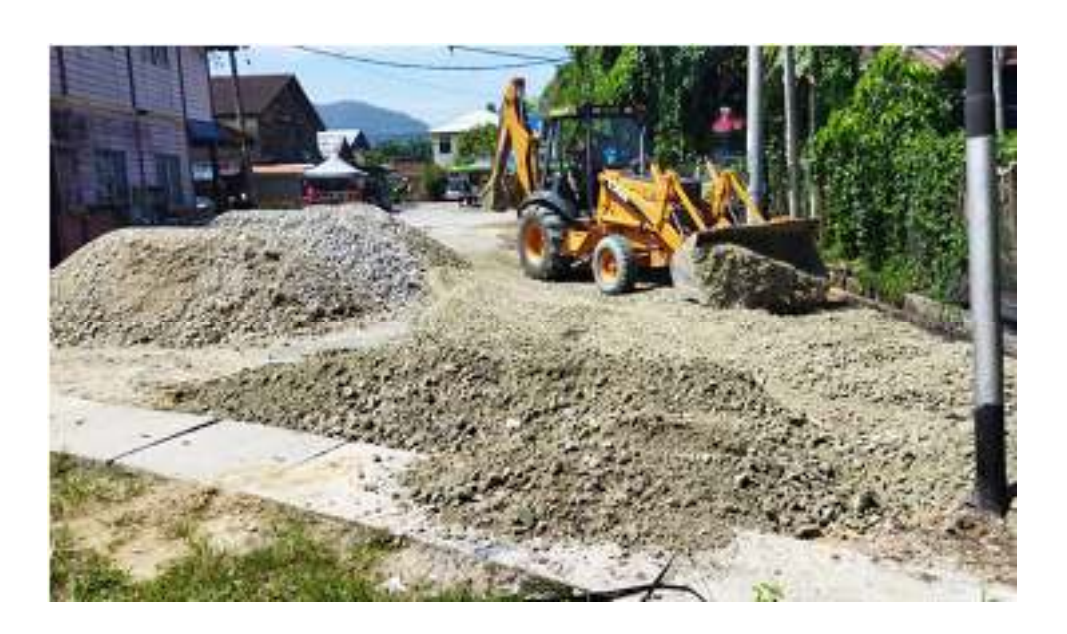
Figure 3.7: A backhoe

Backhoe's function is to levelling the crusher run before the crusher run be compact by roller.