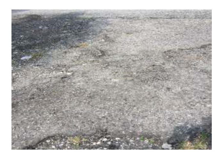
Figure 3.4: Road ravelling

This is affect because of too much dust contain in the premix which cause the bitumen bind the dust more than the premix. This imperfection construct cause the aggregate easily gouge out from the road surface.