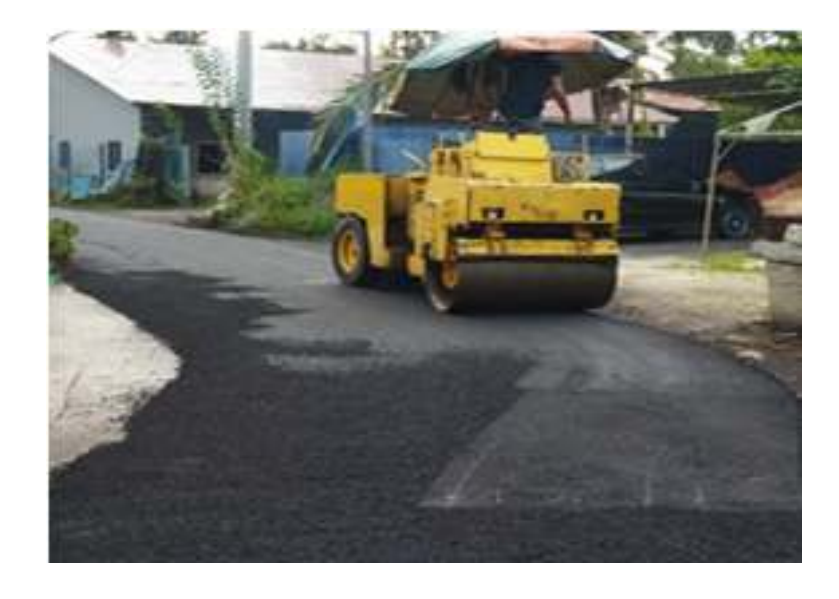
Figure 3.6: A roller