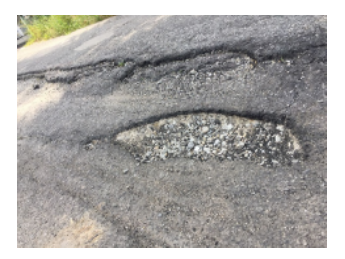
Figure 3.3: The pothole

Pothole is a forming hole which can grows if not fix as soon as possible. This damage happen because of the load of vehicles crack the road and let rain drop in it and cause disintegration process happen.