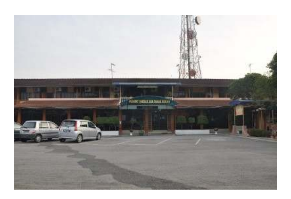
Figure 1.1: Front view of Pejabat Daerah dan Tanah Kerian

Pejabat Daerah dan Tanah Kerian is a government agency which is responsible to administrate Kerian district from all aspect such as development and residences' welfare. It is located at No. 1 Jalan Pejabat, Kampung Permatang Tok Mamat, 34200 Parit Buntar, Perak. There are three units operate under Pejabat Daerah dan Tanah Kerian.. Firstly, Bahagian Khidmat Pengurusan (BKP) which responsible to manage all the units in Pejabat Daerah dan Tanah Kerian. Second, Pejabat Tanah, where all of the affairs about land done here. Lastly, Pembangunan Luar Bandar (PLB) responsible to manage development and welfare residences of rural places.