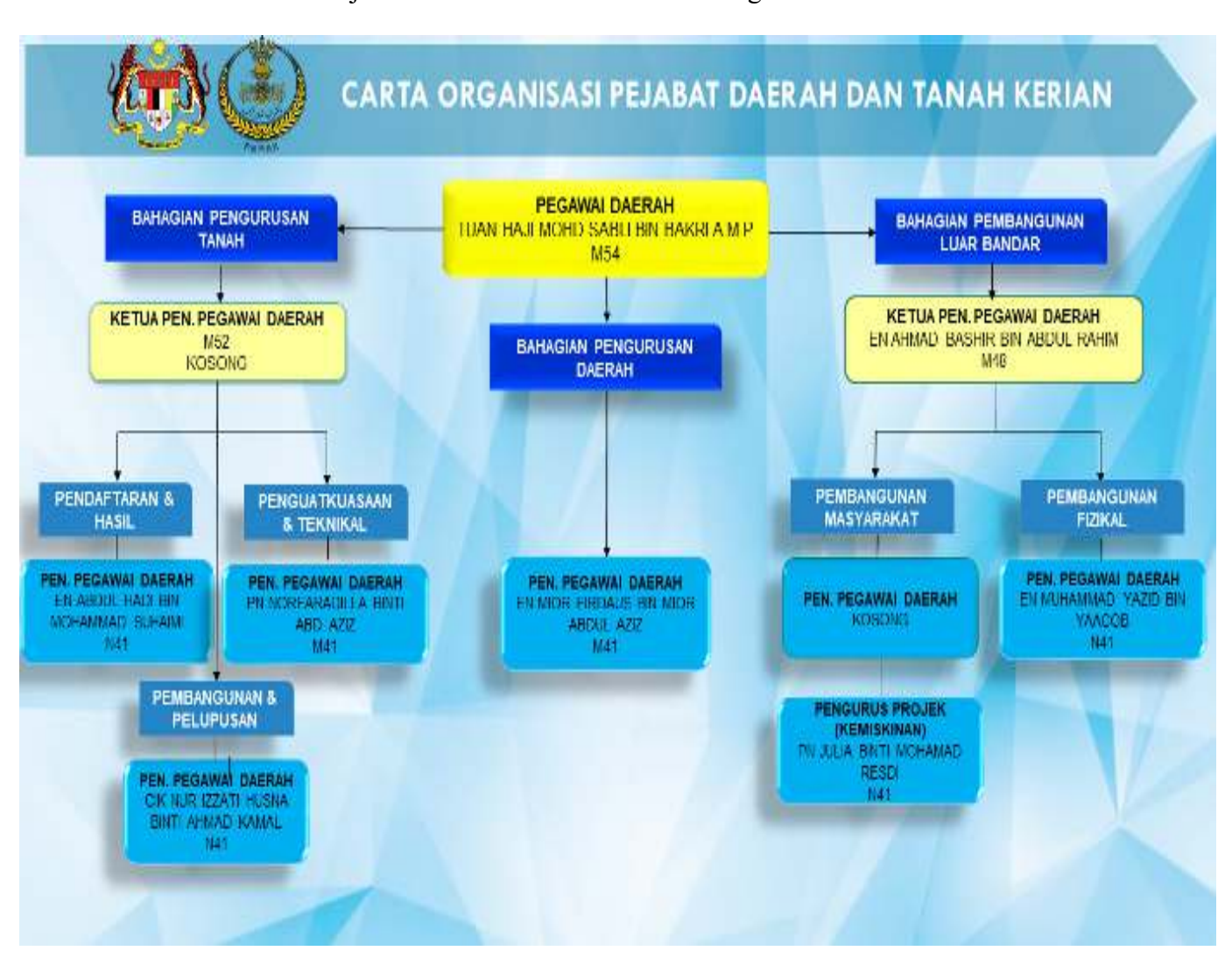
Table 1.2: Pejabat Daerah dan Tanah Kerian's organization chart