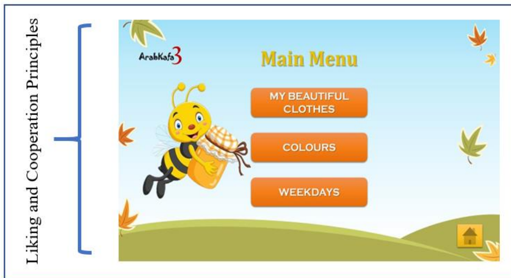
Figure 2: ArabKafa3 Main Menu

Figure 3 depicts the "My Beautiful Clothes" page, which includes Note, Video, Quiz, and Game buttons that correspond to their respective pages. The home button navigates to the homepage, while the "X" button exits the portal. Users chose the icon to reduce memory capacity. The principles of liking and tunnelling apply to this interface design.