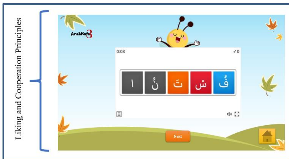
Figure 7: Game Page: My Beautiful Clothe

Games are used to help students enjoy using ArabKafa3. Figure 7 depicts anagram activity, which is available on the Game page for “My Beautiful Clothes” topic. Students must arrange the letters to form the correct word. This user interface design incorporates the principles of liking and cooperation to raise the bar for learning each topic's core concepts and ideas.