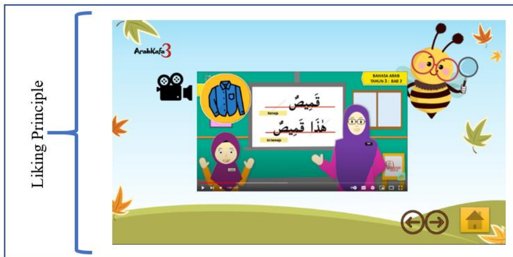
Figure 5: Video Page: My Beautiful Clothes

Figure 5 depicts the Video page for “My Beautiful Clothes” topic. There will be a description box for the students to understand what they are watching. Video is a combination of the most dynamic and realistic multimedia elements that can influence student motivation towards the process of accepting a learning process in an enjoyable manner. In this case, the principle of liking is used to acknowledge students' preferred learning method.