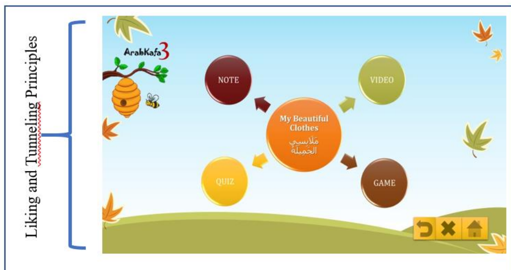
Figure 3: My Beautiful Clothes Page

Figure 3 depicts the "My Beautiful Clothes" page, which includes Note, Video, Quiz, and Game buttons that correspond to their respective pages. The home button navigates to the homepage, while the "X" button exits the portal. Users chose the icon to reduce memory capacity. The principles of liking and tunnelling apply to this interface design.