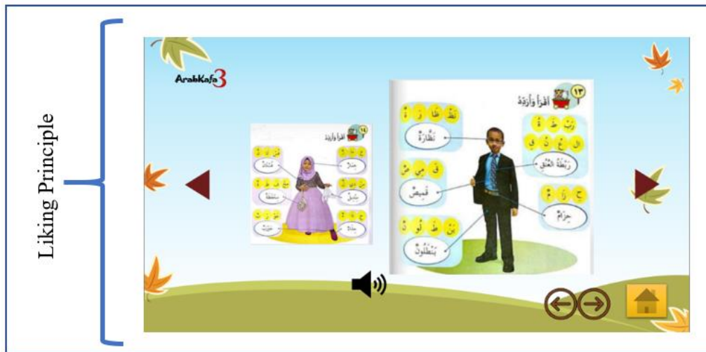
Figure 4: Note Page: My Beautiful Clothes

Figure 5 depicts the Video page for “My Beautiful Clothes” topic. There will be a description box for the students to understand what they are watching. Video is a combination of the most dynamic and realistic multimedia elements that can influence student motivation towards the process of accepting a learning process in an enjoyable manner. In this case, the principle of liking is used to acknowledge students' preferred learning method.