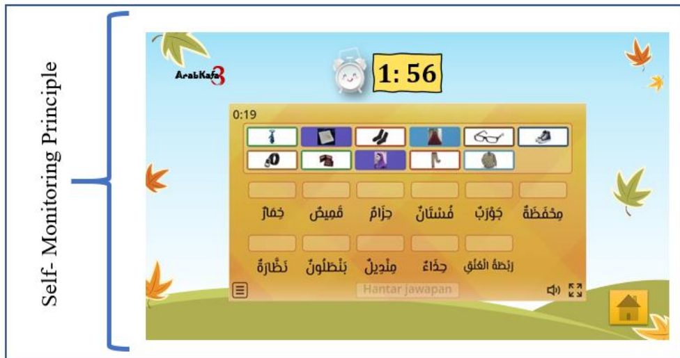
Figure 6: Quiz Page: My Beautiful Clothes

Games are used to help students enjoy using ArabKafa3. Figure 7 depicts anagram activity, which is available on the Game page for “My Beautiful Clothes” topic. Students must arrange the letters to form the correct word. This user interface design incorporates the principles of liking and cooperation to raise the bar for learning each topic's core concepts and ideas.