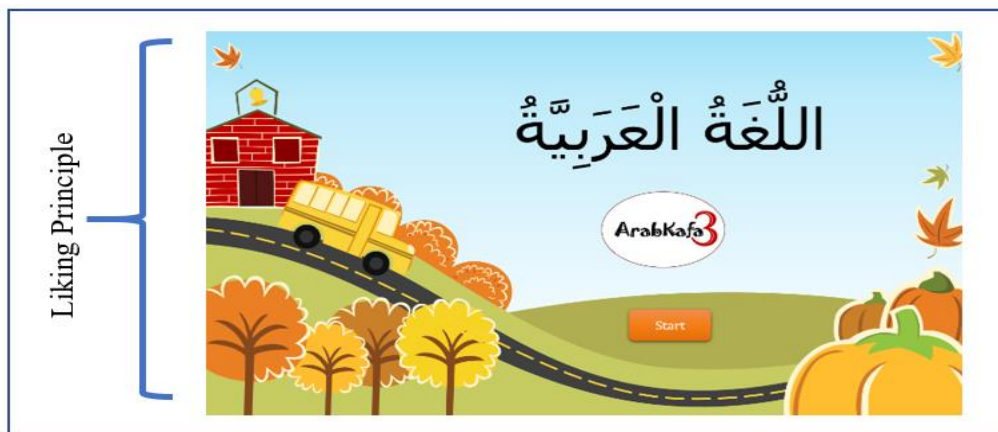
Figure 1: The First Page of ArabKafa3

Figure 1 depicts the first page of ArabKafa3. To proceed to the next page, the user must click the "Start" button. On this page, animation and large-size text are used to draw the user's attention, and the features are related to the liking principle.