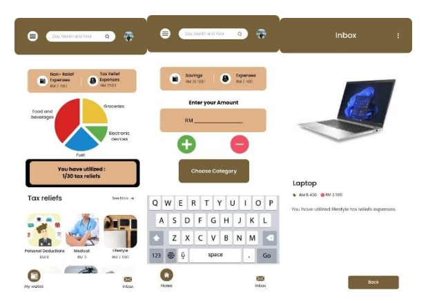
Figure 1. My Tax Buddy interface

To use this app firstly, you must enter your expenses amount. Next, choose a category based on where you spend your money. Then, the apps will automatically tell you that your expenses have tax reliefs or not. There is an indicator in the app that tells your tax reliefs amount and non-tax reliefs expenses. So, this feature will make users aware of their tax reliefs.