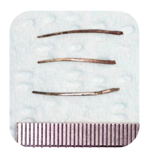
Figure 5: Clinical photo of silver points retrieved from 36