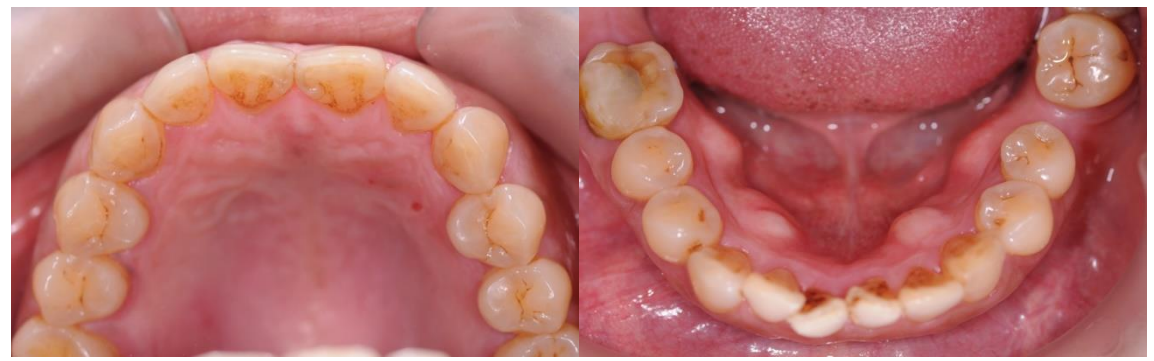
Figure 2: Clinical occlusal view of upper and lower arch

Periapical radiograph showed the presence of silver points, which short about 2mm for the distal canal. Well-defined periapical radiolucency was observed around the mesial and distal canal (Figure 3). A working diagnosis for 36 was chronic apical periodontitis with short silver points root canal filling.