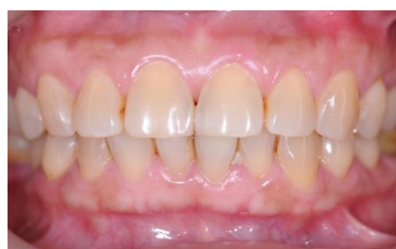
Figure 1: Clinical frontal view

An intra-oral examination presented that her oral hygiene was fair with generalized mild deposit of plaque and calculus (Figure 1). All permanent teeth were present except 18, 28, 37, 38 and 46. There were attrition of 12 and 13. Occlusal amalgam was noted in 48. Composite restorations were noted on 36 and 47 (Figure 2). Periodontal probing in all teeth was within normal limits and normal mobility was detected in all teeth. The tooth 36 was tender to percussion but not tender on palpation; periodontal probing and mobility was within normal limits. There was a large occluso-buccal composite restoration with a distal crackline.