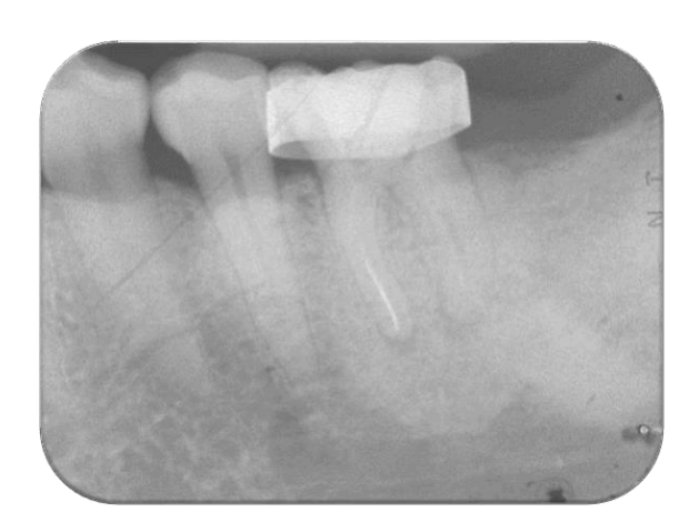
Figure 6: Intra-operative radiograph after removal of silver points