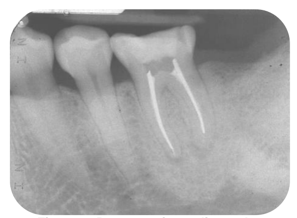
Figure 3: Pre-operative radiograph

After examining the advantages and disadvantages, the prognosis and various treatment options with patient. Patient agreed to proceed with non-surgical root canal treatment retreatment of 36 despite knowing the prognosis is guarded.