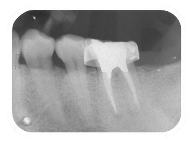
Figure 6: Intra-operative radiograph after removal of silver points