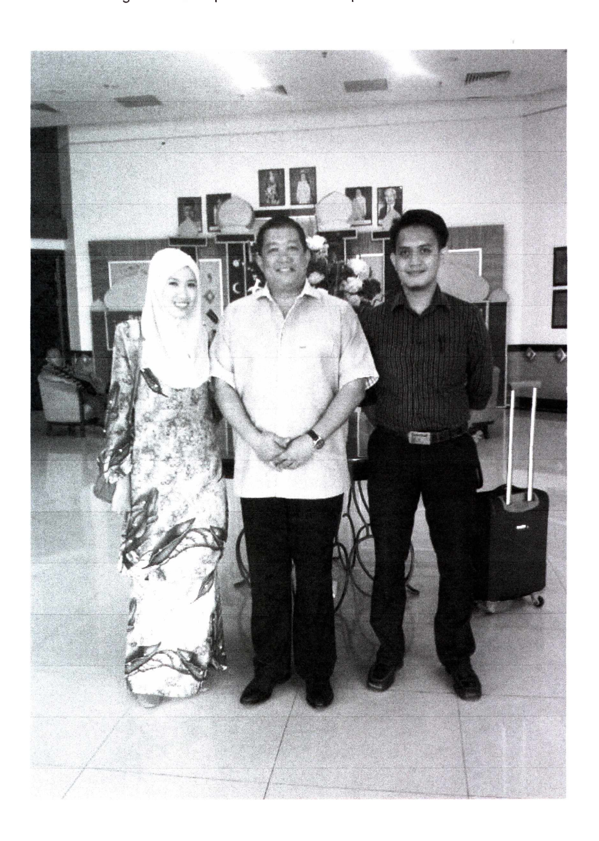
Figure 2.2.2: Supervisor and Host Supervisor