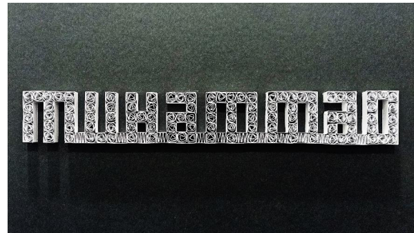
Figure 2: Quilled kufi rumi

and Etruscans (Blake, 1976). After the invention of paper, the nuns during the Renaissance created decorative reliquaries since papers are less expensive than silver and gold. The use of paper was more widespread during the late eighteenth and early nineteenth century as the ladies of these eras decorated baskets, tea caddies, screens, and furniture (Johnston, 1995). Additionally, quilling became popular in the United States when the country was colonised, but its popularity seems to have declined in the late eighteenth century when other arts and hobbies like sewing, drawing and jewellery design began to take place (Cobb, 2022).