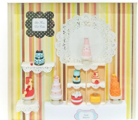
Figure 6: Miniature bakery