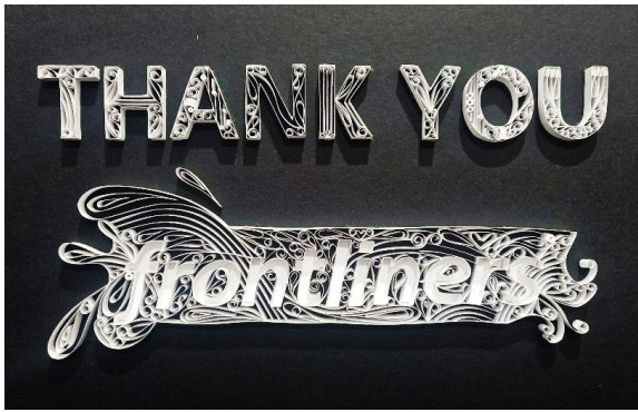
Figure 9: Quilled typography