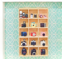
Figure 5: Miniature cameras

Besides being one's inexpensive hobby, quilling can enhance our motor skills since it involves our eye and hand coordination. This is evident when quilling was used to develop the senior pre-schoolers' fine motor skills in a kindergarten in the Ust-Aldan district, Republic of Sakha (Yakutia) (Ammasova & Nikolaeva, 2022). Similarly, in Malaysia, quilling is incorporated in the Standard 4 art class syllabus for the Mosaic Technique or better known as Teknik Mozek (Kementerian Pendidikan Malaysia, 2018). In this lesson, students need to quill colourful paper strips to decorate a cupcake. This can also stimulate their brain since they need to arrange and paste the quilled shapes made on the cupcake. Additionally, it will make the school-going children busy with this activity as compared to playing with their phones or video games as quilling will make them occupied and attentive (Cobb, 2022). This corresponds to Baker (2016, p.2), in which she stated that "The process of quilling is closely tied with mindfulness, the meditative state of paying attention to the present".