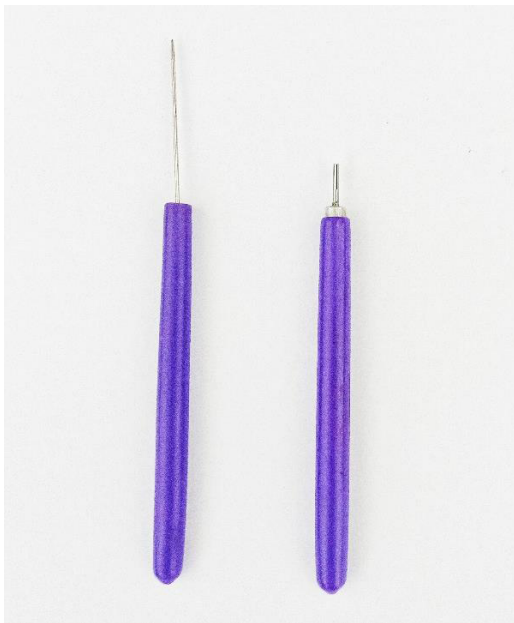
Figure 1: Quilling tools

Quilling, also known as paper filigree, is the art of rolling, pinching, shaping, gluing and arranging paper strips to make beautiful designs and decorative patterns. The roll of paper strips can be done with fingers, a pin, a toothpick/skewer, or a slotted tool; a special needle-like instrument tailored for quilling. Colourful strips of papers with different widths and thickness can be quilled to make beautiful patterns for greeting cards, jewellery, boxes, ornaments, miniatures and many more.