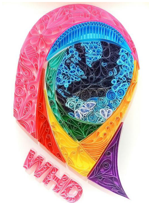
Figure 8: Quilled paper graphic - World Hijab Day

Like many other types of arts, quilling is also one of the ways to increase our creativity. This is because, many art pieces can be created with the quilling technique. We can express ourselves and show how creative we can be with papers. This is apparent as quilling is integrated in making artworks in art classes for the 7th grade students of junior high school 1 Bae Kudus (Pawekas, Syafii & Murtiyoso, 2019) and the 8th grade students of state junior high school 2 Majauleng Kabupaten Wajo District, Indonesia (Khaerunnisa, Saleh & Arifin, 2018), where the students created various animal and flower motifs, besides greeting cards, decorative nameplate, souvenirs of the area or tourist attractions, decorative photo frames and decorations on calendars of various sizes.