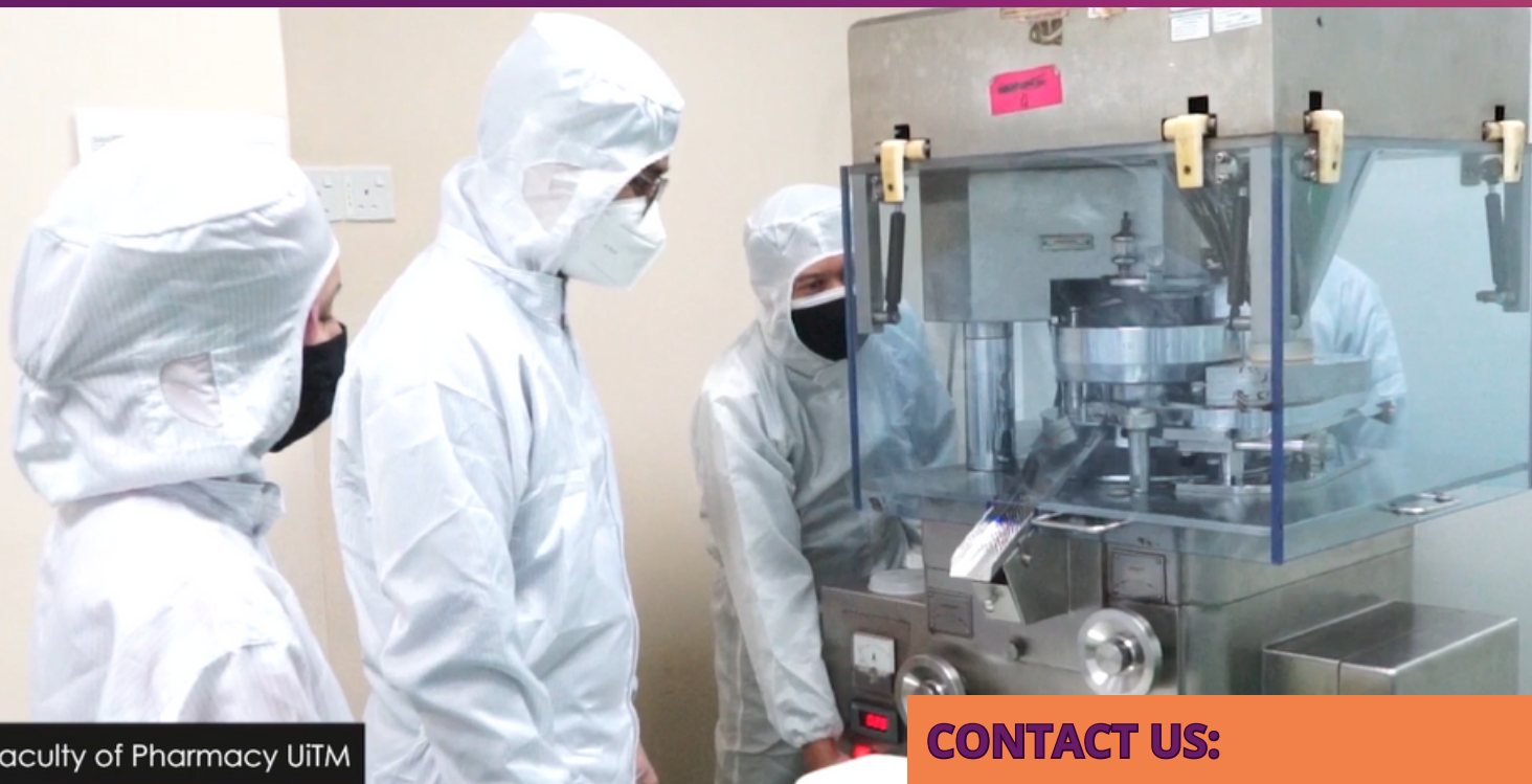
Faculty of Pharmacy UiTM

Latest news and updates from the Faculty of Pharmacy