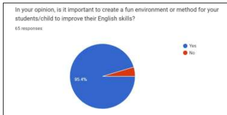
Figure 5. Question 3 of the ‘Before Survey’

Next, most respondents agreed that there should be more sources to teach English besides a textbook.