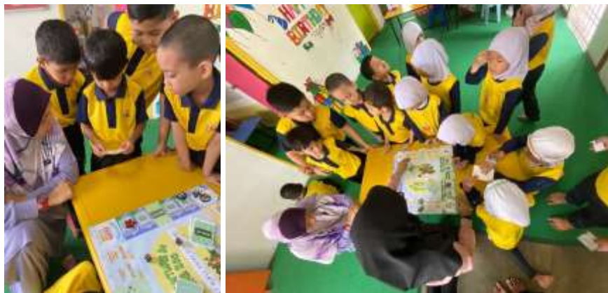
Figure 7. Pictures of the Programme Conducted at Tadika Muttaqin Pintar

The target community should ensure that children are willing to learn new things, and they need to enjoy the process for them to grasp the knowledge easily. Most children are attracted to games or fun things; therefore, learning through playing will benefit them in obtaining new information and building their skills. Additionally, learning to recall vocabulary and spelling through games can help children to easily memorise the terms as children are focused and active when having fun. Playing a language game can encourage them to use the vocabulary they have learned.