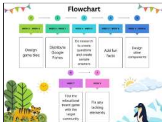
Figure 1. Flowchart

Figure 1 shows the detailed and complete schedule of making an educational board game. The production begins with designing the tiles of the board game. The tiles are based on different species of animals: reptiles, mammals, sea creatures, and animals in the sky. These concepts are chosen because most children are fond of animals, and this is one of the best ways to create an interest in learning for them since the colourful illustrations can attract their attention. Before creating the questions, the Google Form for the 'Before Survey' was distributed via WhatsApp and analysed to identify what type of questions for children are preferred by the target community. Additionally, an English textbook, 'Super Mind', was used for research involving the students' syllabus. This research was conducted to ensure that the