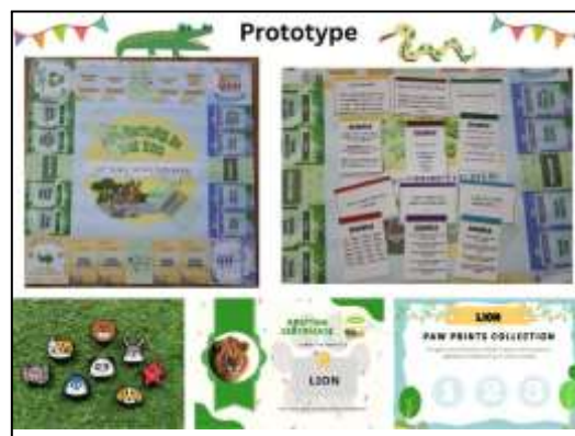
Figure 2. The Prototype

Finally, the two final components of the board game were made. The food packs act as a game currency, and every food pack has the same amount. For example, one pack is equivalent to one game currency or dollar. Besides collecting paw prints, players can also be considered winners if they accumulate the most food packs. If a player answers a question wrongly, they have to pay for one food pack; hence, players must work hard to get as many correct answers as possible to avoid losing their food packs. The four final tiles are located at the four corners of the board game, and one of them contains a question that involves creating a simple sentence. The board game revolves around vocabulary and spelling; hence, it is a great opportunity for the players to use what they have learned in class or during the game session and attempt to create a sentence.